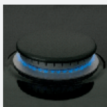
Dual-stacked sealed burner.

This appliance is certified by Star-K to meet strict religious regulations in conjunction with specific instructions found on www.star-k.org .