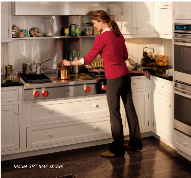
Model SRT484F shown.

The patented, dual-stacked sealed gas burners of our new sealed burner rangetop take control to a new level. Two levels, really. The upper-tier burner delivers maximum heat transfer at higher settings; the lower-tier continuous flame ably handles the subtleties of simmering and melting. The Wolf exclusive infrared charbroiler, infrared griddle and French top ensure this rangetop stands out from the rest in performance and also beauty. Available in natural or LP gas.