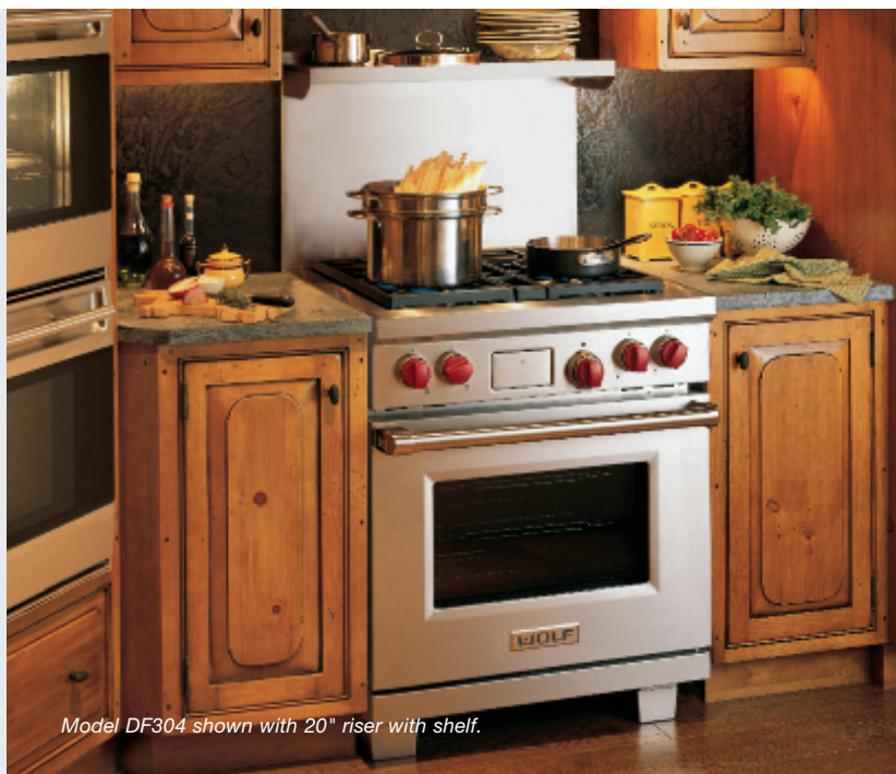
Model DF304 shown with 20" riser with shelf.

With Wolf's dual fuel range you have state-of-the-art cooking expertise to meet the discriminating consumers' needs. The dual fuel range offers standard dual-stacked sealed surface burners. The large electric oven features ten cooking modes and the Wolf exclusive dual convection system that delivers even temperature and airflow throughout. The dual fuel range is available in natural or LP gas.