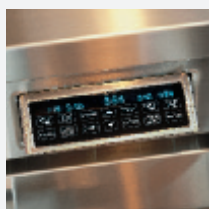
Rotating control panel.