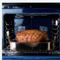
Cobalt blue oven interior.