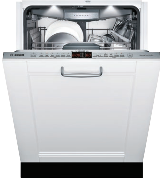
SHV8PT53UC Panel Ready

Expandable wings on our flexible 3rd rack provide extra height to fit ramekins, measuring cups and extra-large utensils.