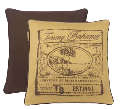
Chocolate 8880-18RR 18W x 18H in. 8880-20RR 20W x 20H in. 8880-24RR 24W x 24H in. Available only as shown: Face 7613-71, Back 7404-74, Welt 7404-74