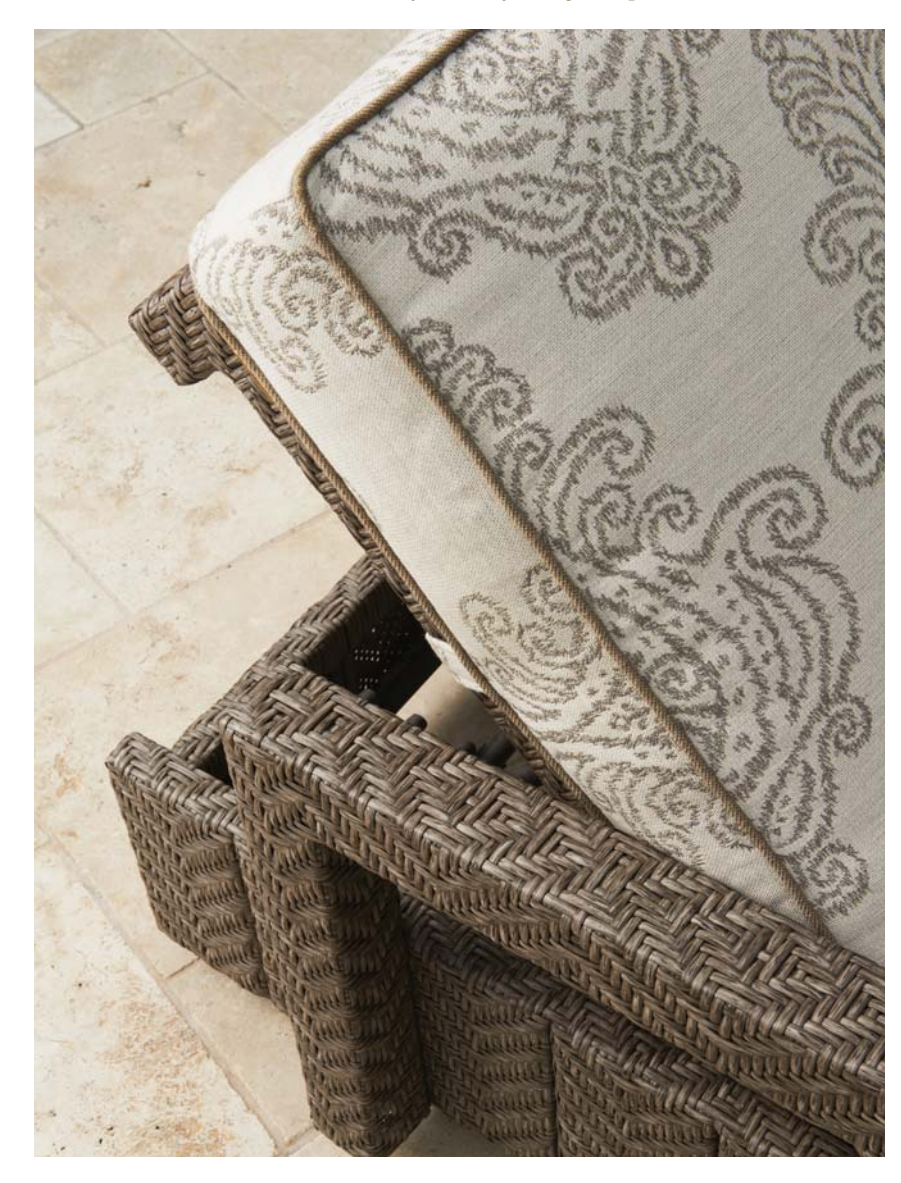
3230-75 Blue Olive Chaise Lounge Frame Only 32.5W x 80.5D x 34H in.

The Blue Olive chaise lounge offers exceptional comfort with plush WeatherGuard™ cushioning, a standard 26"x 12" kidney pillow and an adjustable back rest. The kidney pillow affords an opportunity to showcase contrasting fabrics. Wheels on the back feet allow for easy transport.