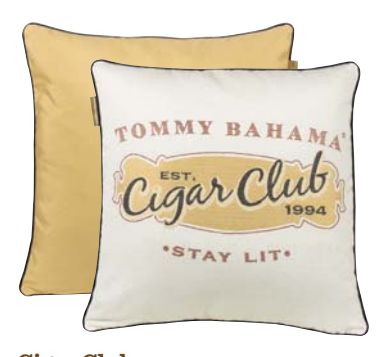
Cigar Club 8880-18HH 18W x 18H in. 8880-20HH 20W x 20H in. 8880-24HH 24W x 24H in. Available only as shown: Face 5500-11, Back 7404-41, Welt 7404-75