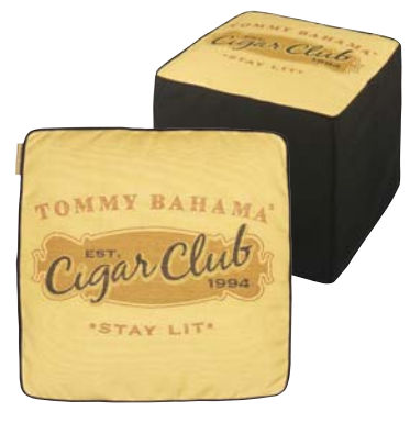
8980-45JJ Cigar Club (Tobacco) 19W x 19D x 17H in. Available only as shown: Top 5500-61, Sides 7404-75, Welt 7404-75