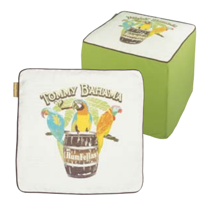
8980-45GG Rum Fellas 19W x 19D x 17H in. Available only as shown: Top 5400-61, Sides 7404-21, Welt 7404-74