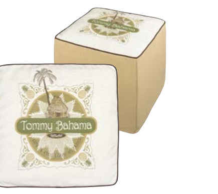
8980-45EE 88 Long Weekend 5a 19W x 19D x 17H in. 19 Available only as shown: Av Top 5200-61, Sides 7409-71, Welt 7404-74 Welt 7404-74