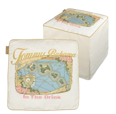
8980-45AA In The Drink 19W x 19D x 17H in. Available only as shown: Top 4500-61, Sides 7409-11,

Island Ottomans feature signature Tommy Bahama designs to enhance any outdoor setting. They are available only as shown. Frames are rustproof aluminum, on casters, covered with a padded surface. Slipcovers slide over that padded surface. Island Ottomans and Paradise Pillows coordinate, meaning the AA designation represents the same graphic design on the pillow and ottoman.