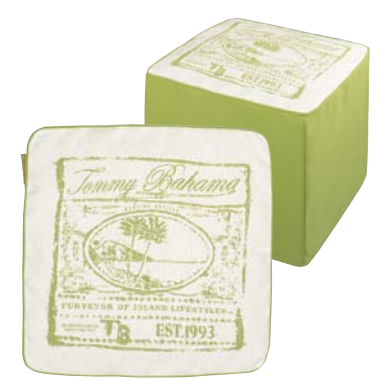
8980-45PP Kiwi 19W x 19D x 17H in. Available only as shown: Top 7613-21, Sides 7404-21, Welt 7404-21