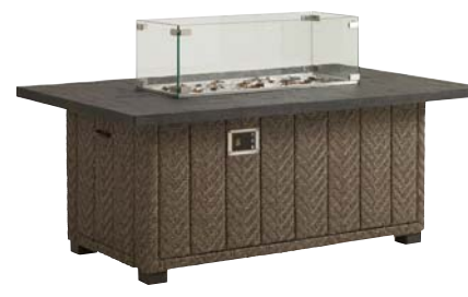
3100-92FPS Alfresco Living Tempered Glass Flame Guard 31W \times 12.5D \times 10H in. Shown on Page 12