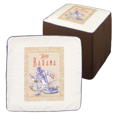
8980-45MM Paradise Casino 19W x 19D x 17H in. Available only as shown: Top 5800-11, Sides 7404-74, Welt 7408-31