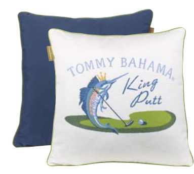
King Putt 8880-18CC 18W x 18H in. 8880-20CC 20W x 20H in. 8880-24CC 24W x 24H in. Available only as shown: Face 5100-61, Back 7408-31, Welt 7404-21