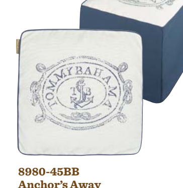
8980-45BB Anchor's Away 19W x 19D x 17H in. Available only as shown: Top 5000-61, Sides 7408-31, Welt 7408-31