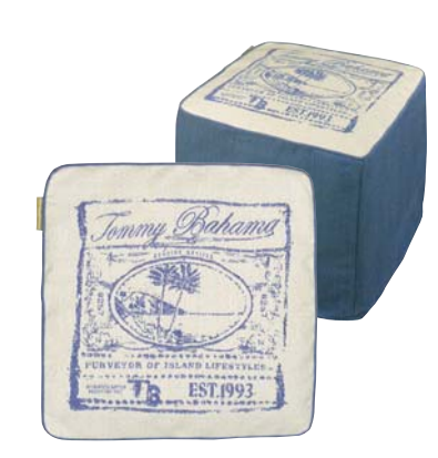
8980-45QQ Cobalt 19W x 19D x 17H in. Available only as shown: Top 7613-31, Sides 7401-31, Welt 7401-31