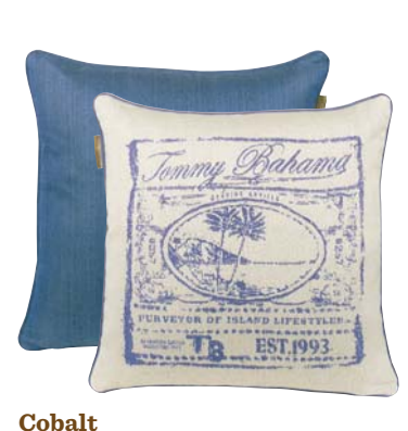
8880-18QQ 18W x 18H in. 8880-20QQ 20W x 20H in. 8880-24QQ 24W x 24H in. Available only as shown: Face 7613-31, Back 7401-31, Welt 7401-31