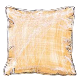
8881-24 Throw Pillow

Contact a Tommy Bahama Outdoor dealer for further details.