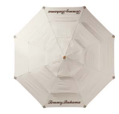
3100-610 Tommy Bahama Signature Umbrella

11 ft. dia. x 8 ft. 9 in. H Pole type and color: 2 inch, one piece wooden pole Fabric number and color: