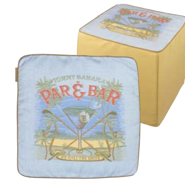
8980-45LL Par & Bar (Ocean) 19W x 19D x 17H in. Available only as shown: Top 5600-61, Sides 7404-41, Welt 7404-71