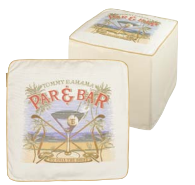
8980-45KK Par & Bar 19W x 19D x 17H in. Available only as shown: Top 5600-11, Sides 7409-11, Welt 7404-41