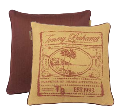
Burgundy 8880-18SS 18W x 18H in. 8880-20SS 20W x 20H in. 8880-24SS 24W x 24H in. Available only as shown: Face 7613-51, Back 7401-51, Welt 7401-51