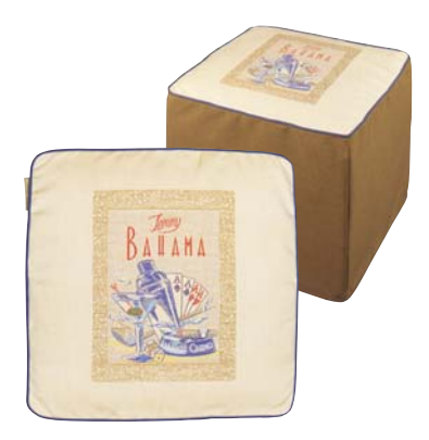
8980-45NN 89 Paradise Casino (Fresco) Ki 19W x 19D x 17H in. 19 Available only as shown: Av Top 5800-61, Sides 7404-72, Welt 7408-31 Welt 7408-31