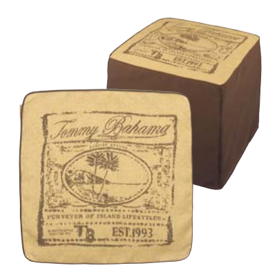
8980-45RR Chocolate 19W x 19D x 17H in. Available only as shown: Top 7613-71, Sides 7404-74, Welt 7404-74