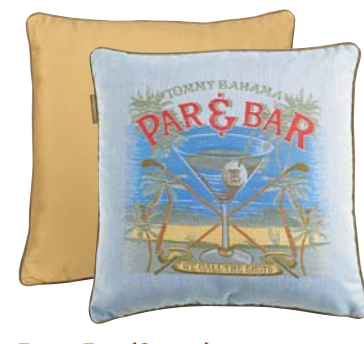
Par & Bar (Ocean) 8880-18LL 18W x 18H in. 8880-20LL 20W x 20H in. 8880-24LL 24W x 24H in. Available only as shown: Face 5600-61, Back 7404-41, Welt 7404-71