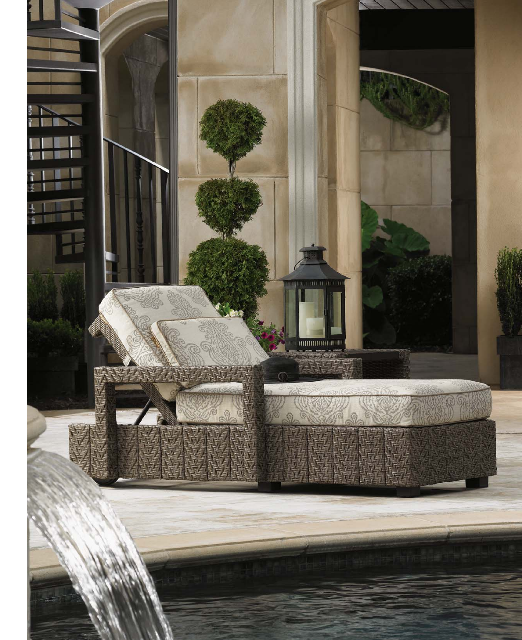
CS3230-75 Blue Olive Chaise Lounge Cushion Set