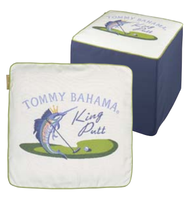
8980-45CC King Putt 19W x 19D x 17H in. Available only as shown: Top 5100-61, Sides 7408-31, Welt 7404-21