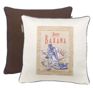
Paradise Casino 8880-18MM 18W x 18H in. 8880-20MM 20W x 20H in. 8880-24MM 24W x 24H in. Available only as shown: Face 5800-11, Back 7404-74, Welt 7408-31