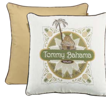
Long Weekend 8880-18EE 18W x 18H in. 8880-20EE 20W x 20H in. 8880-24EE 24W x 24H in. Available only as shown: Face 5200-61, Back 7409-71, Welt 7404-74