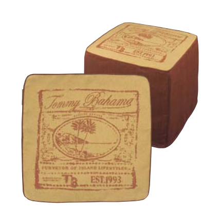
8980-45SS Burgundy 19W x 19D x 17H in. Available only as shown: Top 7613-51, Sides 7401-51, Welt 7401-51