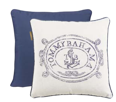
Anchor's Away 8880-18BB 18W x 18H in. 8880-20BB 20W x 20H in. 8880-24BB 24W x 24H in. Available only as shown: Face 5000-61, Back 7408-31, Welt 7408-31