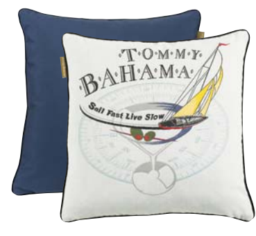
Sail Fast 8880-18FF 18W x 18H in. 8880-20FF 20W x 20H in. 8880-24FF 24W x 24H in. Available only as shown: Face 5300-61, Back 7408-31, Welt 7404-75