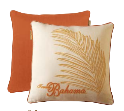
Salmon 8880-18TT 18W x 18H in. 8880-20TT 20W x 20H in. 8880-24TT 24W x 24H in. Available only as shown: Face 7644-11, Back 7422-51, Welt 7422-51