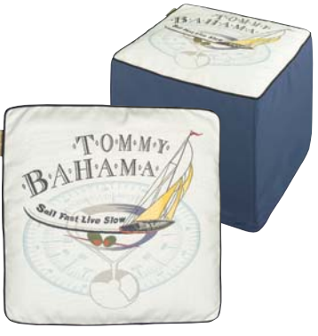
8980-45FF Sail Fast 19W x 19D x 17H in. Available only as shown: Top 5300-61, Sides 7408-31, Welt 7404-75