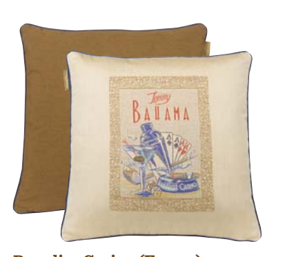
Paradise Casino (Fresco) 8880-18NN 18W x 18H in. 8880-20NN 20W x 20H in. 8880-24NN 24W x 24H in. Available only as shown: Face 5800-61, Back 7404-72, Welt 7408-31