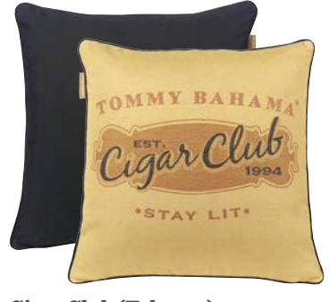
Cigar Club (Tobacco) 8880-18JJ 18W x 18H in. 8880-20JJ 20W x 20H in. 8880-24JJ 24W x 24H in. Available only as shown: Face 5500-61, Back 7404-75, Welt 7404-75