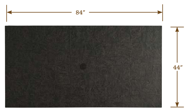
3230-876WT Blue Olive Weatherstone™ Top 84W x 44D x 1.5H in.