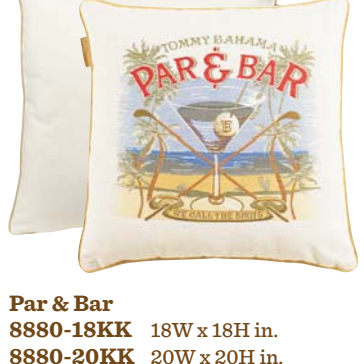
8880-18KK 18W x 18H in. 8880-20KK 20W x 20H in. 8880-24KK 24W x 24H in. Available only as shown: Face 5600-11, Back 7409-11, Welt 7404-41