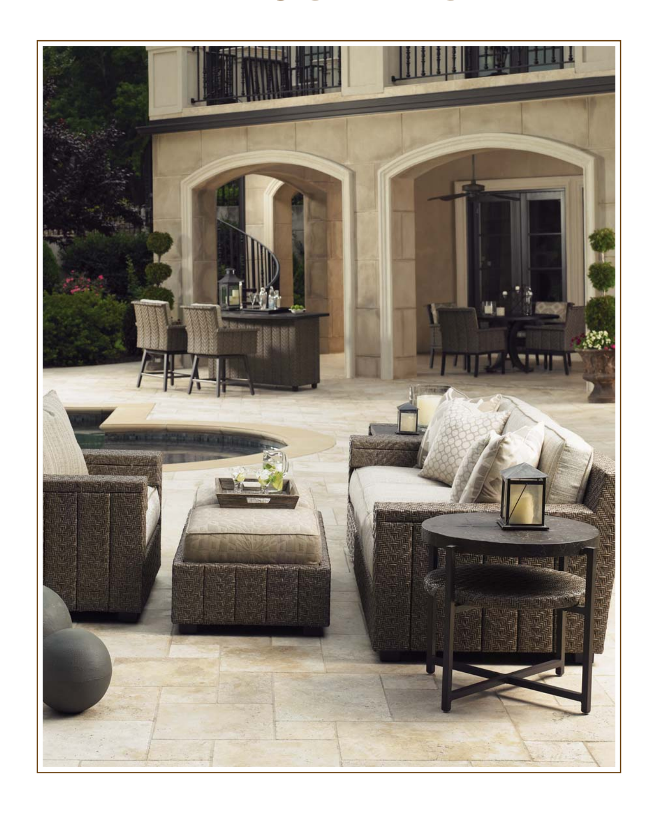
Tommy Bahama outdoor living