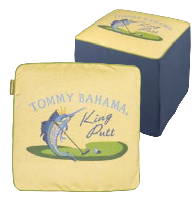
8980-45DD King Putt (Sunbleach) 19W x 19D x 17H in. Available only as shown: Top 5100-41, Sides 7408-31, Welt 7404-21