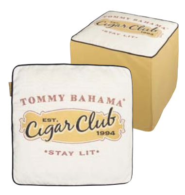
8980-45HH Cigar Club 19W x 19D x 17H in. Available only as shown: Top 5500-11, Sides 7404-41, Welt 7404-75