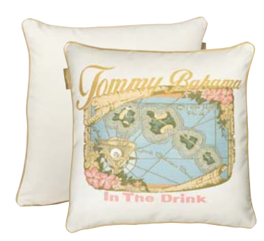
In The Drink 8880-18AA 18W x 18H in. 8880-20AA 20W x 20H in. 8880-24AA 24W x 24H in. Available only as shown: Face 4500-61, Back 7409-11, Welt 7404-41

Paradise Pillows feature signature Tommy Bahama designs to enhance any outdoor setting. They are available only as shown. The pillow fill is 100% all-weather fiber with a water resistant ticking that is thermally sealed to prevent water penetration. The same designs are utilized on coordinating Island Ottomans, meaning the AA designation has the same graphic design on the pillow face as the seat of the slipcover ottoman. The fabric on the pillow back matches the fabric on the welts and skirts of the ottoman.