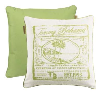
Kiwi 8880-18PP 18W x 18H in. 8880-20PP 20W x 20H in. 8880-24PP 24W x 24H in. Available only as shown: Face 7613-21, Back 7404-21, Welt 7404-21