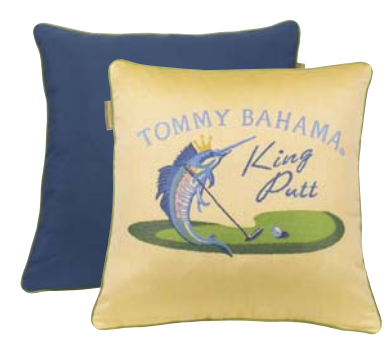
King Putt (Sunbleach) 8880-18DD 18W x 18H in. 8880-20DD 20W x 20H in. 8880-24DD 24W x 24H in. Available only as shown: Face 5100-41, Back 7408-31, Welt 7404-21