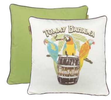
Rum Fellas 8880-18GG 18W x 18H in. 8880-20GG 20W x 20H in. 8880-24GG 24W x 24H in. Available only as shown: Face 5400-61, Back 7404-21, Welt 7404-74