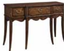
35-090 Sideboard W 58 . D 18 . H 40 in Three drawers, silverware tray in center drawer, adjustable levelers Pages 15, 17