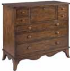
35-038 Media Chest W 42 . D 19 . H 41-1/2 in Eight drawers, top center drawer flips down and pulls out, cord exits, adjustable levelers Pages 23