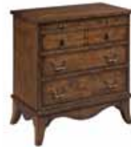
35-141 Nightstand W 28 . D 16 . H 31-3/4 in Four drawers, black pull-out laminate shelf, adjustable levelers Pages 5, 6, 7, 11