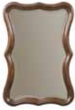
35-012 Accent Mirror W 24 . D 1-1/2 . H 36 in Beveled glass Pages 23