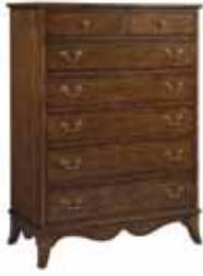
35-105 Drawer Chest W 40 . D 19 . H 57 in Seven drawers, adjustable levelers Page 8