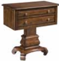
35-039 Accent Chest W 32 . D 18 . H 34 in Two felt-lined drawers, adjustable levelers Pages 10, 18, 20, 21