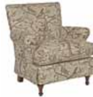
120-94 Slipcover Chair W 33 . D 34 . H 36 in Pages 10, 11, 12, 13

View the complete selection of Homecoming slipcover upholstery at www.KincaidFurniture.com