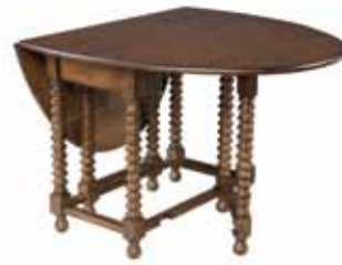
35-059 Gate Leg Table W 40 . D 60 . H 30 in