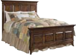
35-130H Panel Bed Headboard 4/6 - 5/0 W 67-5/8 . D 3-3/4 . H 64 in Headboard: H 64 in