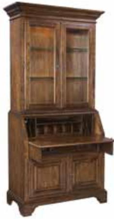
35-041B Secretary Base W 42 . D 19-1/4 . H 40 in Two doors, one drawer, pull-out supports, drop down desk, electrical harness, dividers, adjustable levelers