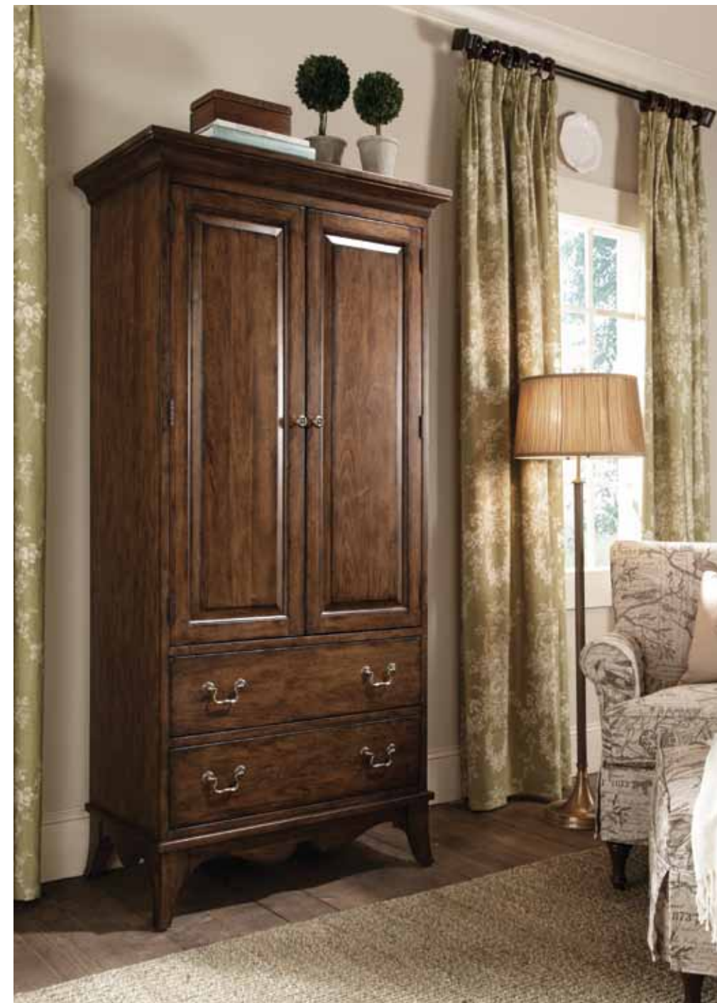
Opposite Page and Above | 35-170 Armoire