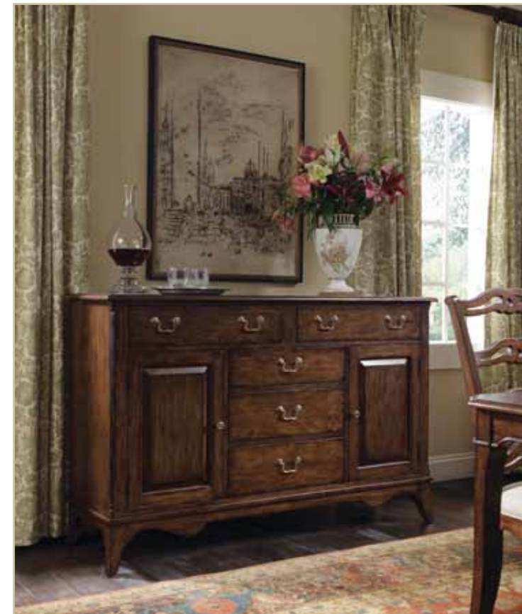
35-075 China Base