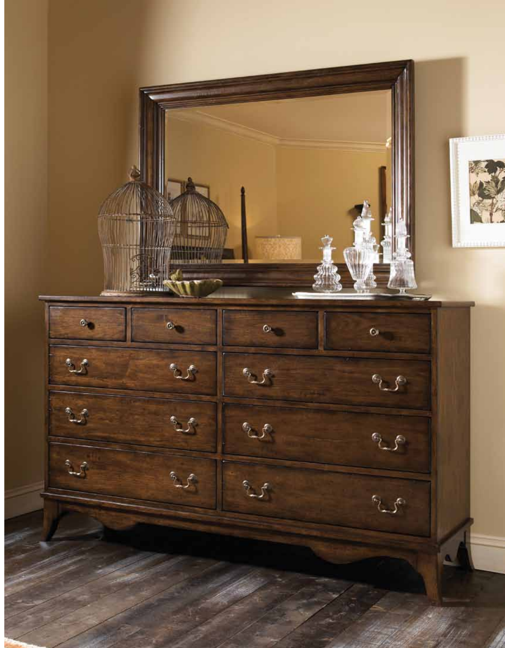
Opposite Page | 35-160 Drawer Dresser, 35-114 Landscape Mirror