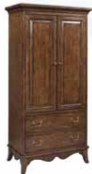
35-170 Armoire W 36 . D 20 . H 75 in Two doors with drawer behind with wood dividers, two adjustable shelves with fixed shelf, cord exits, two cedar drawers, adjustable levelers Pages 12, 13