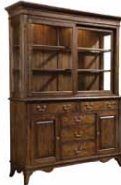
35-075 China Base W 62 . D 18 . H 40 in Five drawers, two doors with adjustable shelves behind each door, silverware tray in top right drawer, adjustable levelers