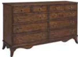
35-160 Drawer Dresser W 68 . D 19 . H 41-1/2 in Ten drawers, adjustable levelers Pages 9