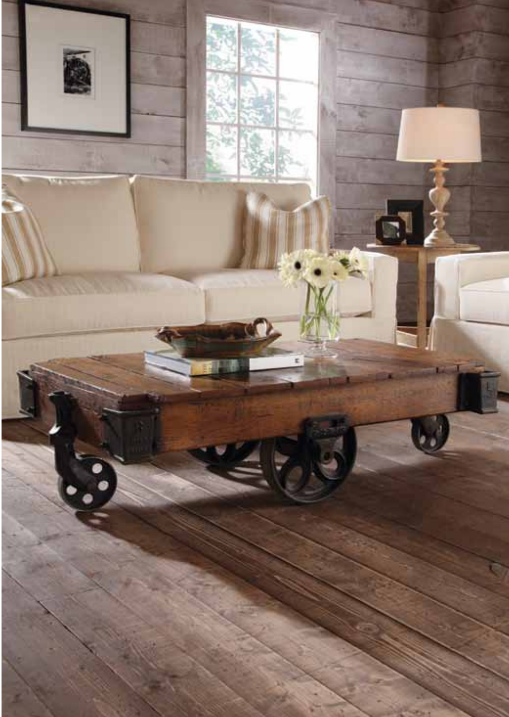
37-023 Shop Truck Cocktail Table