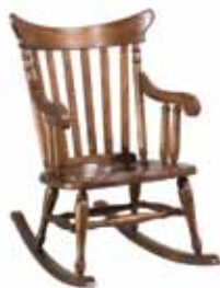
35-040 Grandma's Rocker W 23-5/16 . D 30-13/16 . H 37-3/8 in Pages 11, 22