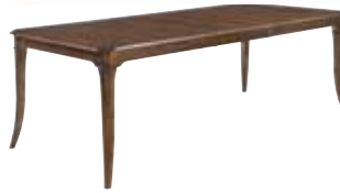
35-056 Clip Corner Rectangular Table W 42 . D 68 . H 30 in Two 20 in Apron leaves

Assembled Sizes: W 42 . D 68 . H 30 in (with no leaves) W 42 . D 88 . H 30 in (with one leaf) W 42 . D 108 . H 30 in (with two leaves) Pages 16, 17