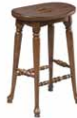
35-069 Counter Stool W 12 . D 16 . H 24 in Pages 20