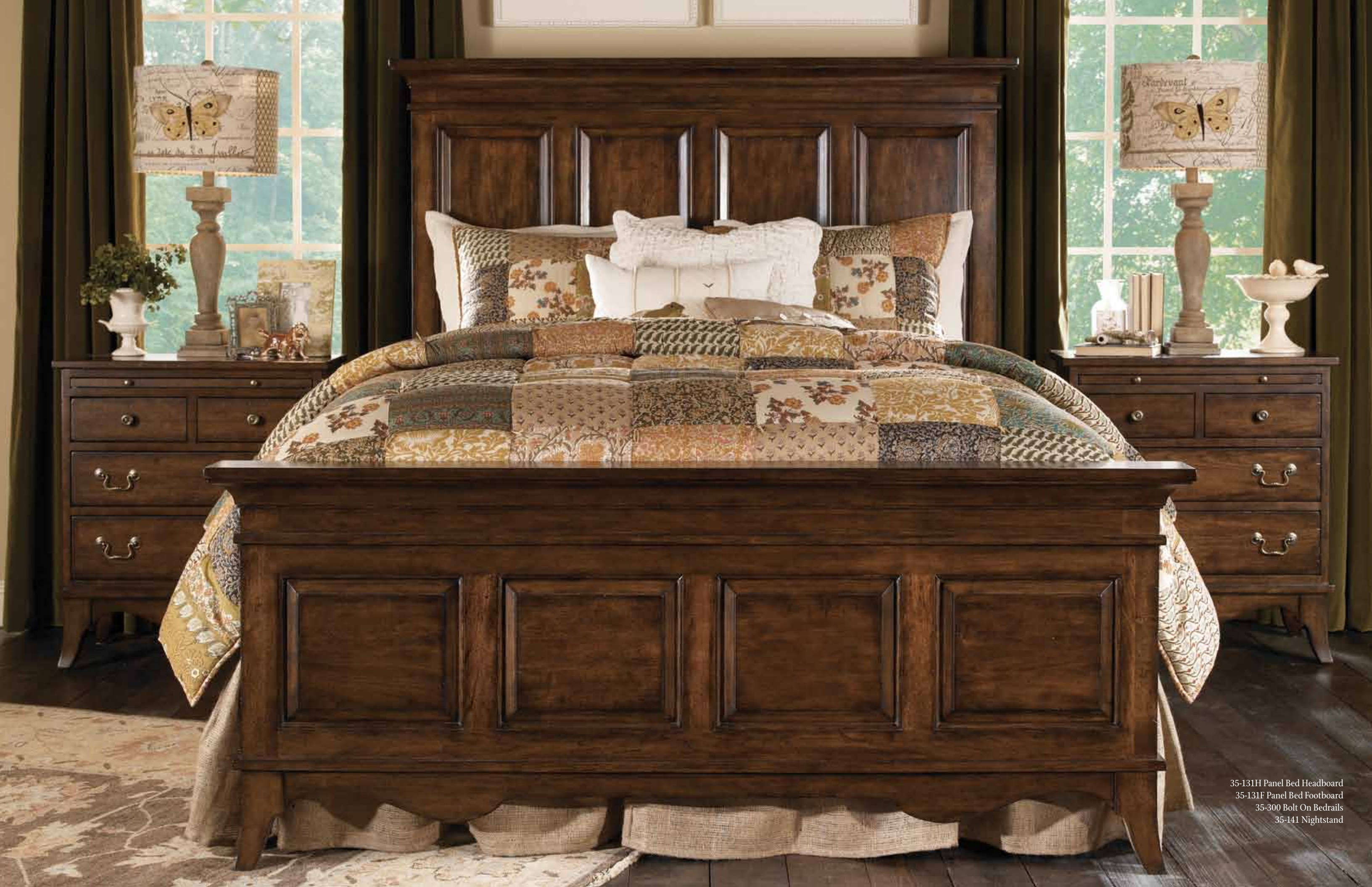
35-131H Panel Bed Headboard 35-131F Panel Bed Footboard 35-300 Bolt On Bedrails 35-141 Nightstand