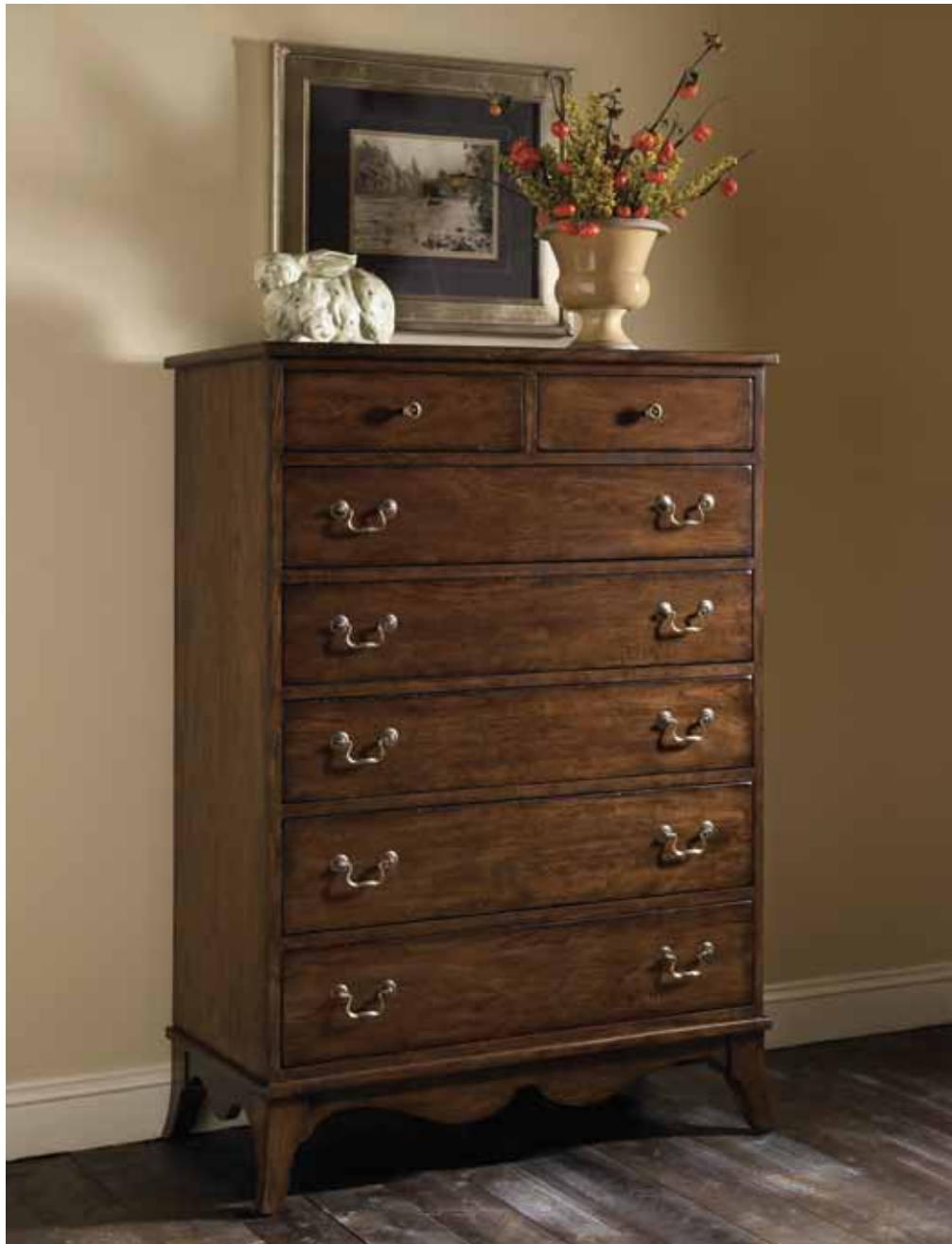
35-105 Drawer Chest