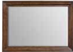
35-114 Landscape Mirror W 50 . D 2-5/8 . H 36 in Beveled glass Pages 9