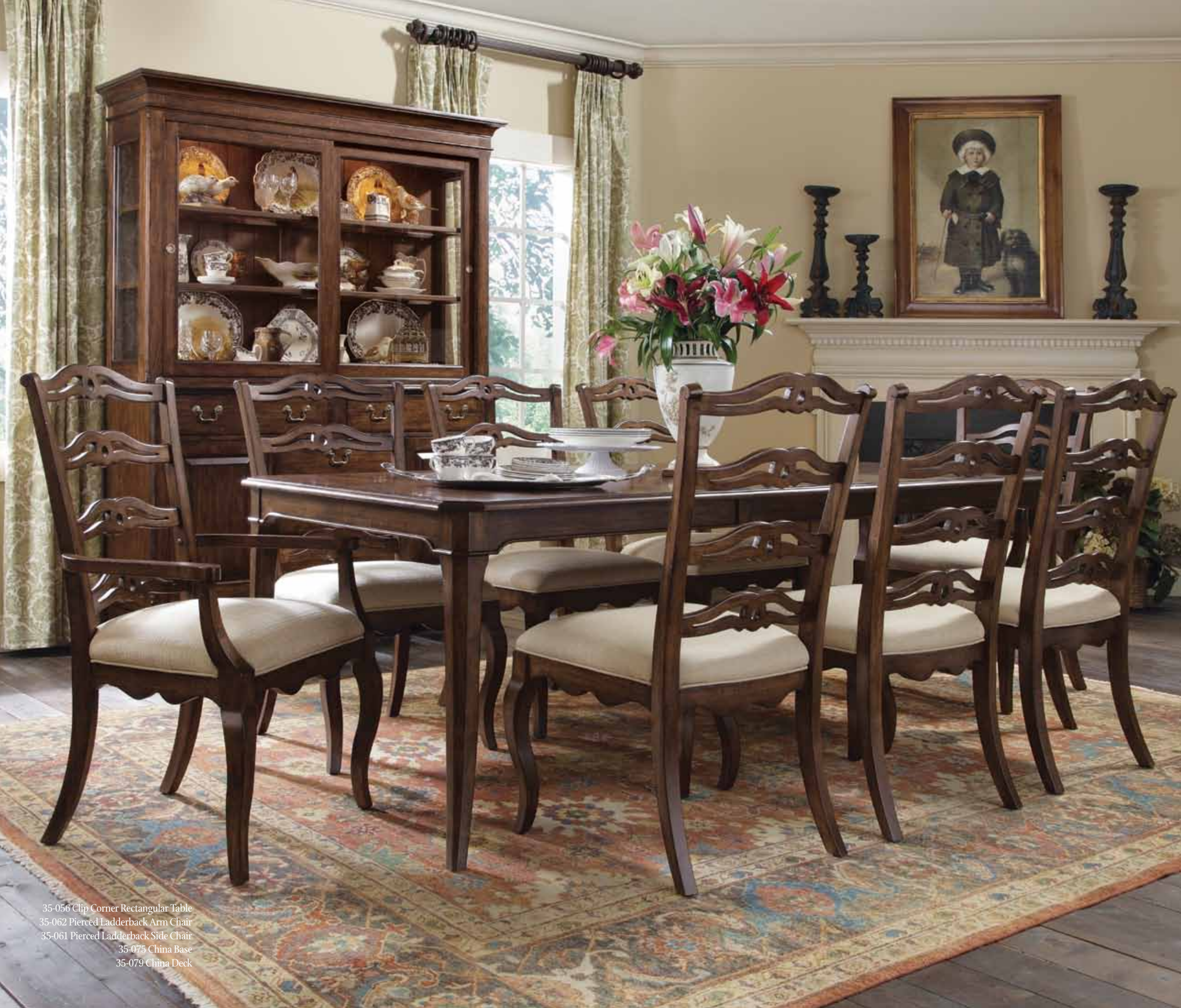
35-056 Clip Corner Rectangular Table 35-062 Pierced Ladderback Arm Chair 35-061 Pierced Ladderback Side Chair 35-075 China Base 35-079 China Deck