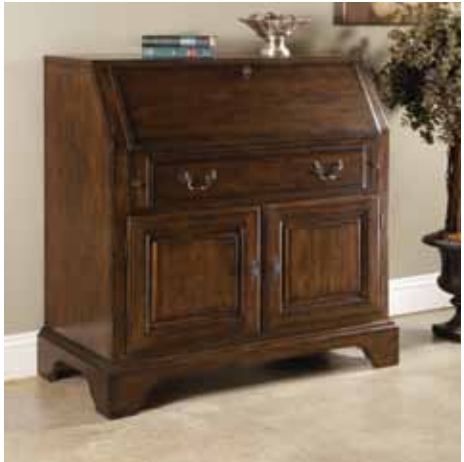
35-041B Secretary Base