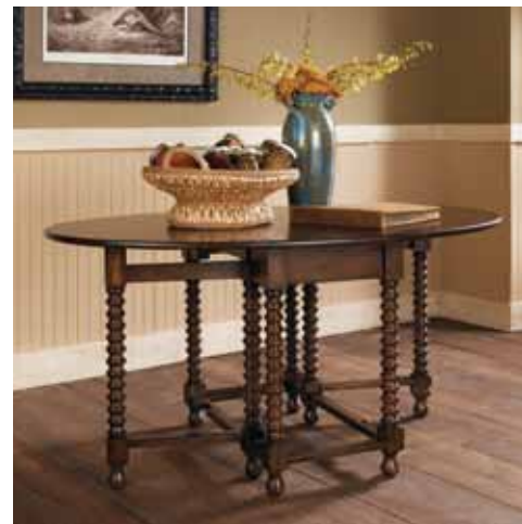
35-059 Gate Leg Table

Opposite Page | 35-038 Media Chest, 35-012 Accent Mirror