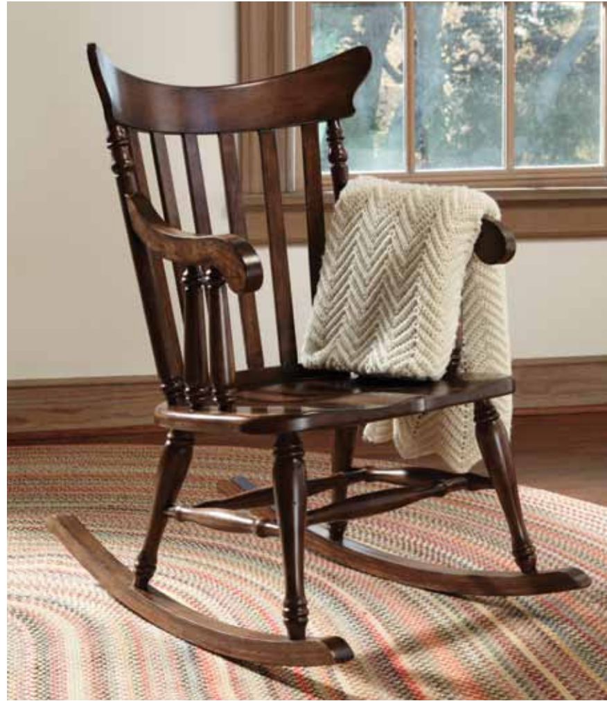
35-040 Grandma's Rocker