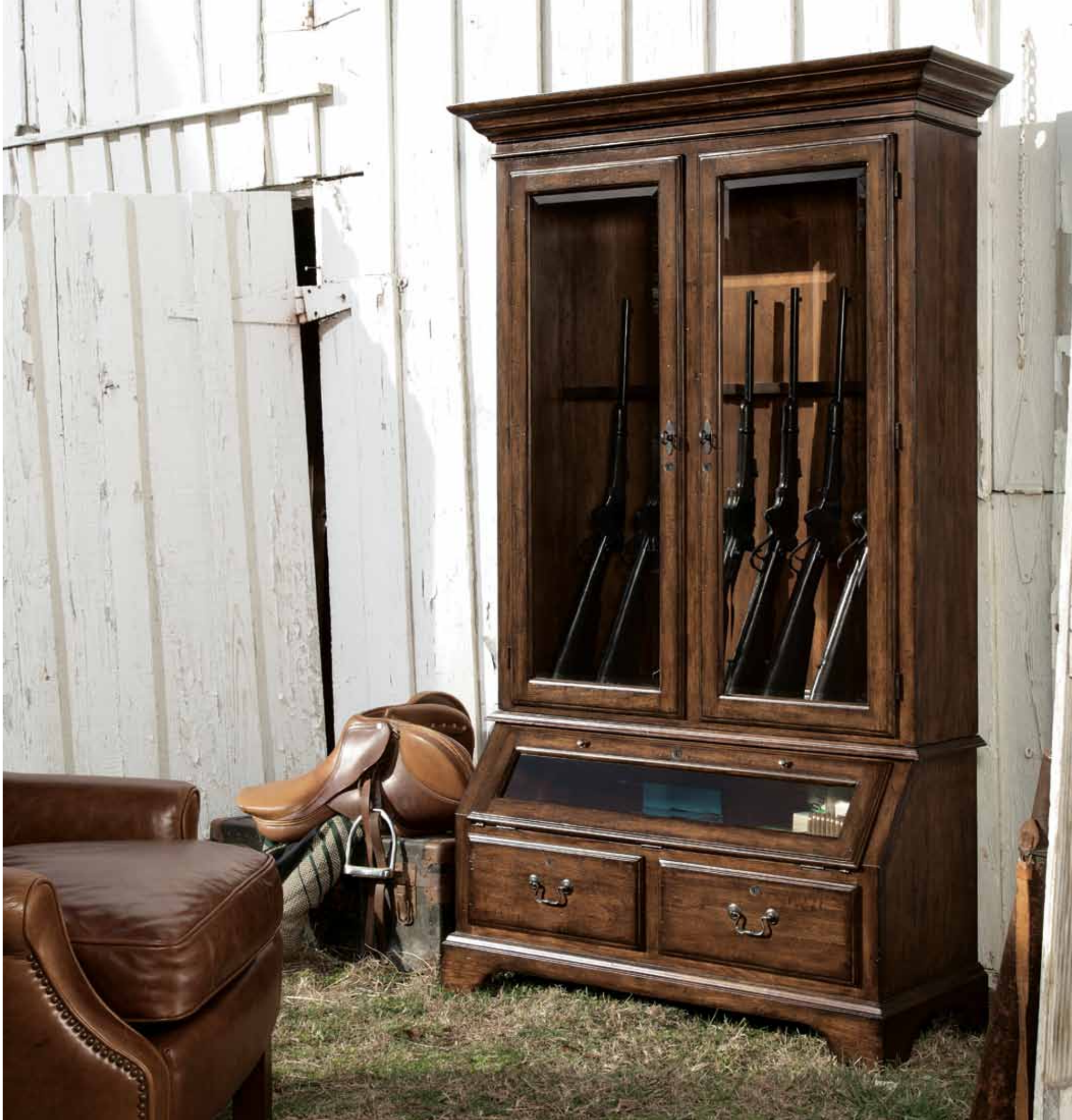
Opposite Page and Above | 35-042B Collector's Cabinet Base, 35-042D Collector's Cabinet Deck