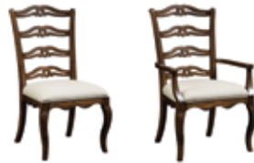
35-061 Pierced Ladderback Side Chair W 22-5/8 . D 24-3/4 . H 41 in Wood back slats, upholstered seat Seat Height: 18-3/8 in Seat Depth: 18 in

Assembled Sizes: W 42 . D 68 . H 30 in (with no leaves) W 42 . D 88 . H 30 in (with one leaf) W 42 . D 108 . H 30 in (with two leaves) Pages 16, 17