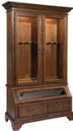
35-042B Collector's Cabinet Base W 43-3/4 . D 18 . H 25 in One flip-down door for display, working locks, two full-extension heavy duty drawers, adjustable levelers