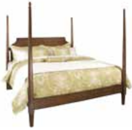
Headboard post: H 80-3/4 in Headboard panel: H 56 in