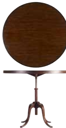
COUNTER HEIGHT: 36H