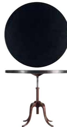
COUNTER HEIGHT: 36H