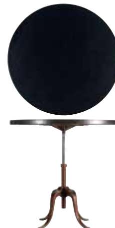
BAR HEIGHT: 42H