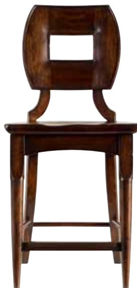
135-11-72 Wood Counter Stool Barrel finish (details p. 13)