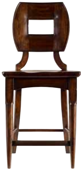
135-11-72 Wood Counter Stool Barrel finish (details p. 13)