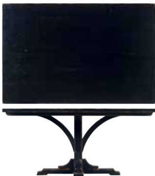
135-81-136 TOP, 135-81-236 BASE