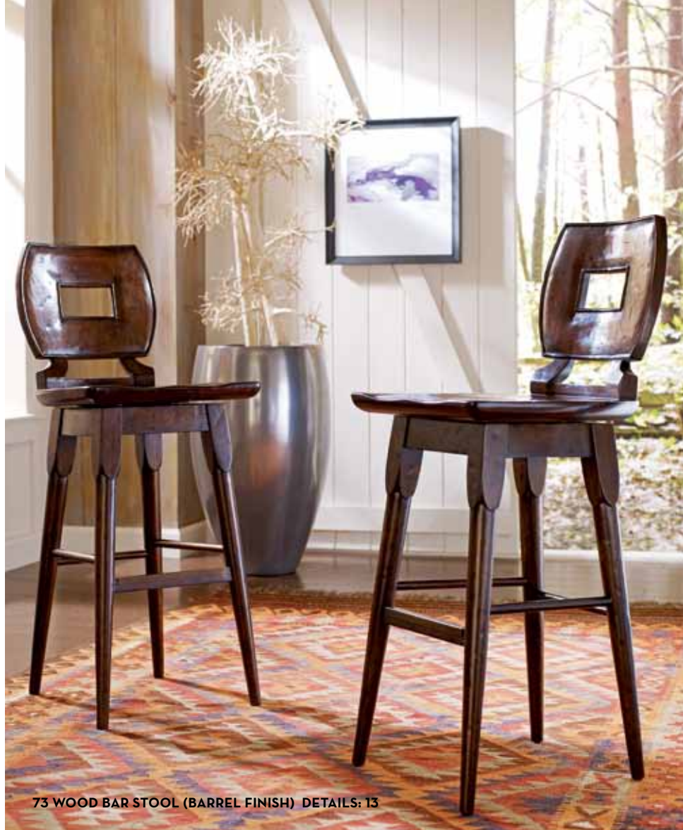
73 WOOD BAR STOOL (BARREL FINISH) DETAILS: 13