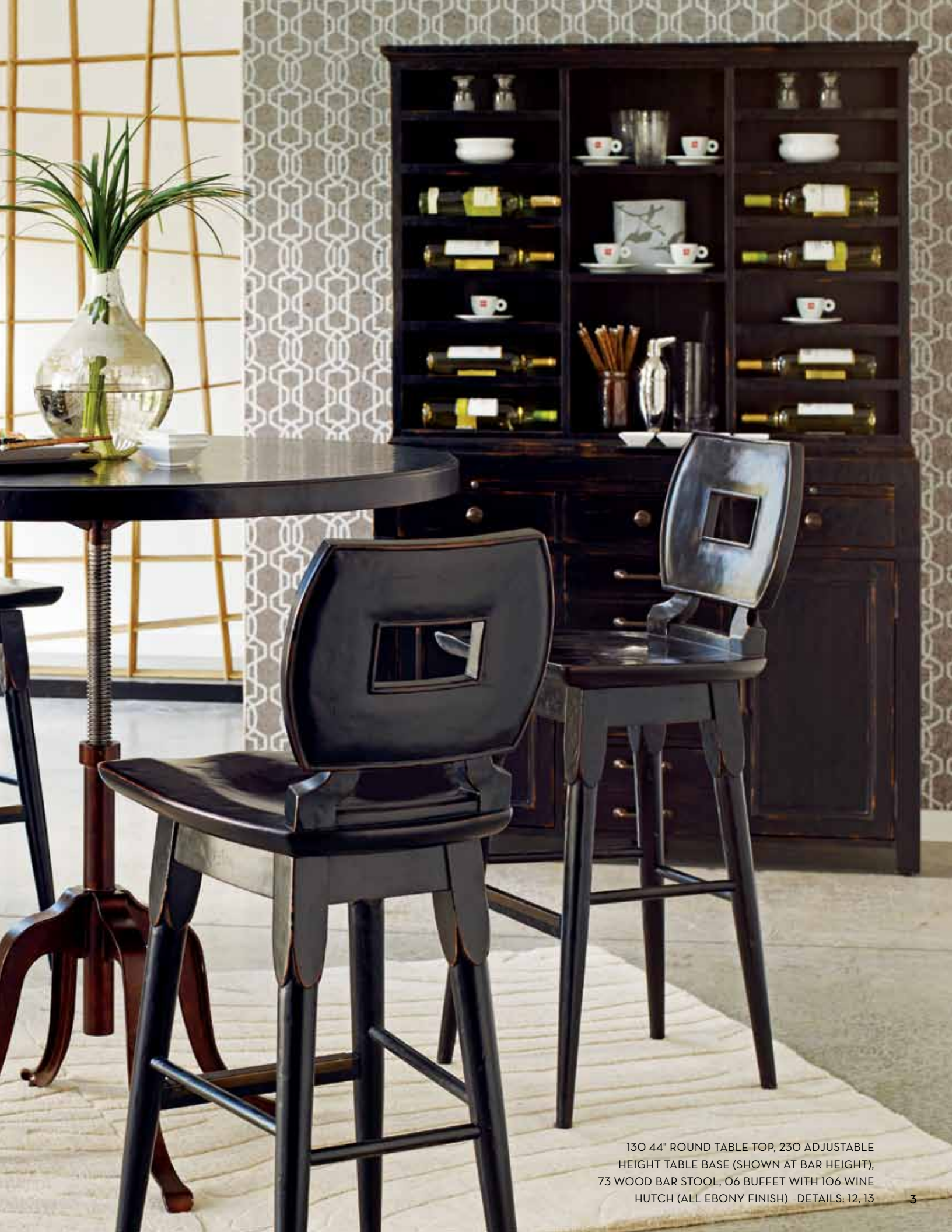
130 44" ROUND TABLE TOP, 230 ADJUSTABLE HEIGHT TABLE BASE (SHOWN AT BAR HEIGHT), 73 WOOD BAR STOOL, 06 BUFFET WITH 106 WINE HUTCH (ALL EBONY FINISH) DETAILS: 12, 13