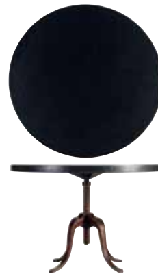
DINING HEIGHT: 30H