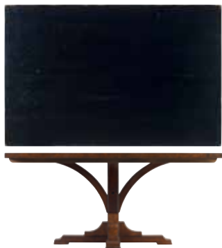
135-81-136 TOP, 135-11-236 BASE