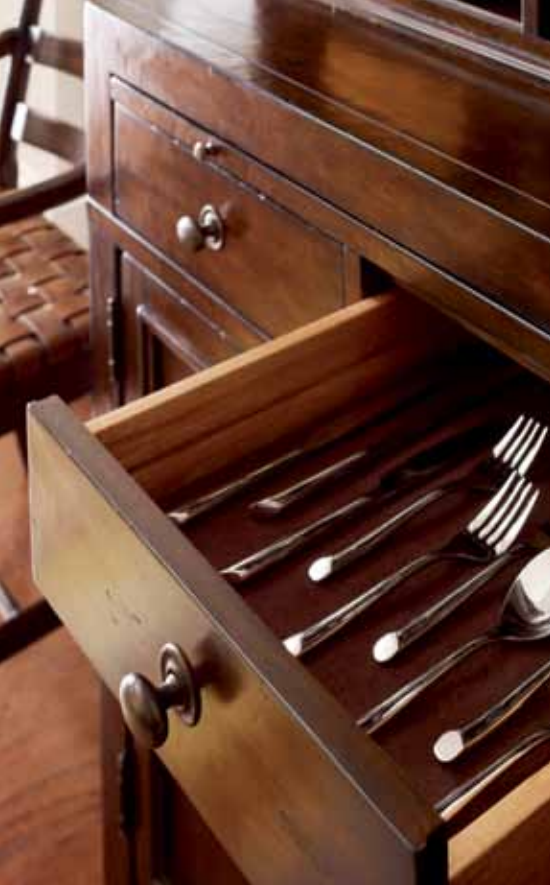
136 PEDESTAL TABLE TOP (EBONY FINISH), 236 PEDESTAL TABLE BASE (BARREL FINISH), 70 LADDERBACK ARM CHAIR (BARREL FINISH), 60 LADDERBACK SIDE CHAIR (BARREL FINISH), O6 BUFFET WITH 106 WINE HUTCH (BARREL FINISH) DETAILS: 12, 13