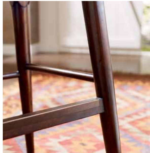
ABOVE: Kick plates protect the footrests of the Wood Bar and Counter Stools.