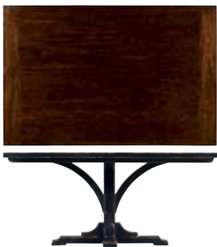
135-11-136 TOP, 135-81-236 BASE