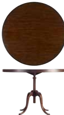
DINING HEIGHT: 30H