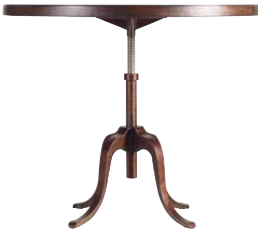
135-11-130 44" Round Table Top Barrel finish