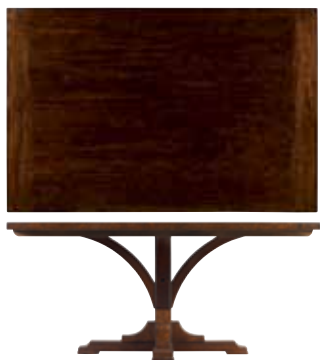
135-11-136 TOP, 135-11-236 BASE

SEE INSIDE FRONT COVER, PAGES 3, 4, 5, 10, 11