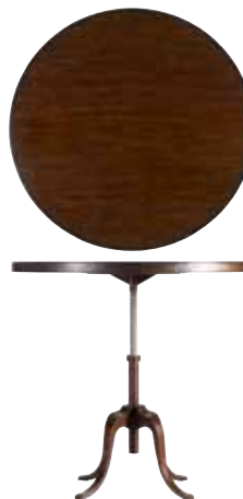
BAR HEIGHT: 42H