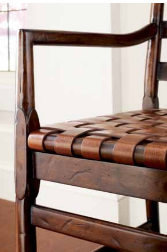
TOP: Flatware rests safely in a felt-lined drawer.