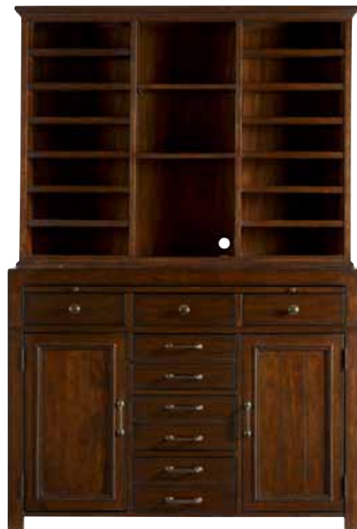
135-11-106 Wine Hutch

BOTTOM: An additional work surface tucks away in its pocket when not in use.