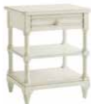
451-23-81 TELEPHONE TABLE PARCHMENT