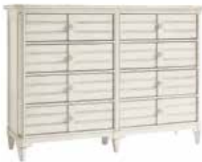
451-23-06 DRESSER PARCHMENT

W 67 7 / 8 " D 66" H 86 3 / 4 " (172 × 168 × 220 cm)