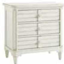
451-23-80 NIGHTSTAND PARCHMENT