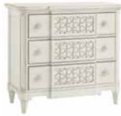
451-23-16 BACHELOR'S CHEST PARCHMENT