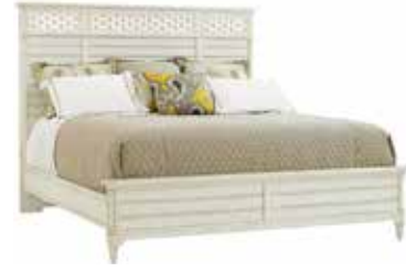
451-23-40 WOOD PANEL BED, QUEEN PARCHMENT