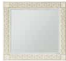
451-23-30 MIRROR PARCHMENT