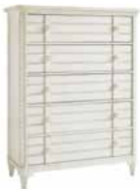
451-23-12 DRAWER CHEST PARCHMENT

W 83 3 / 8 " D 66" H 86 3 / 4 " (213 × 168 × 220 cm)