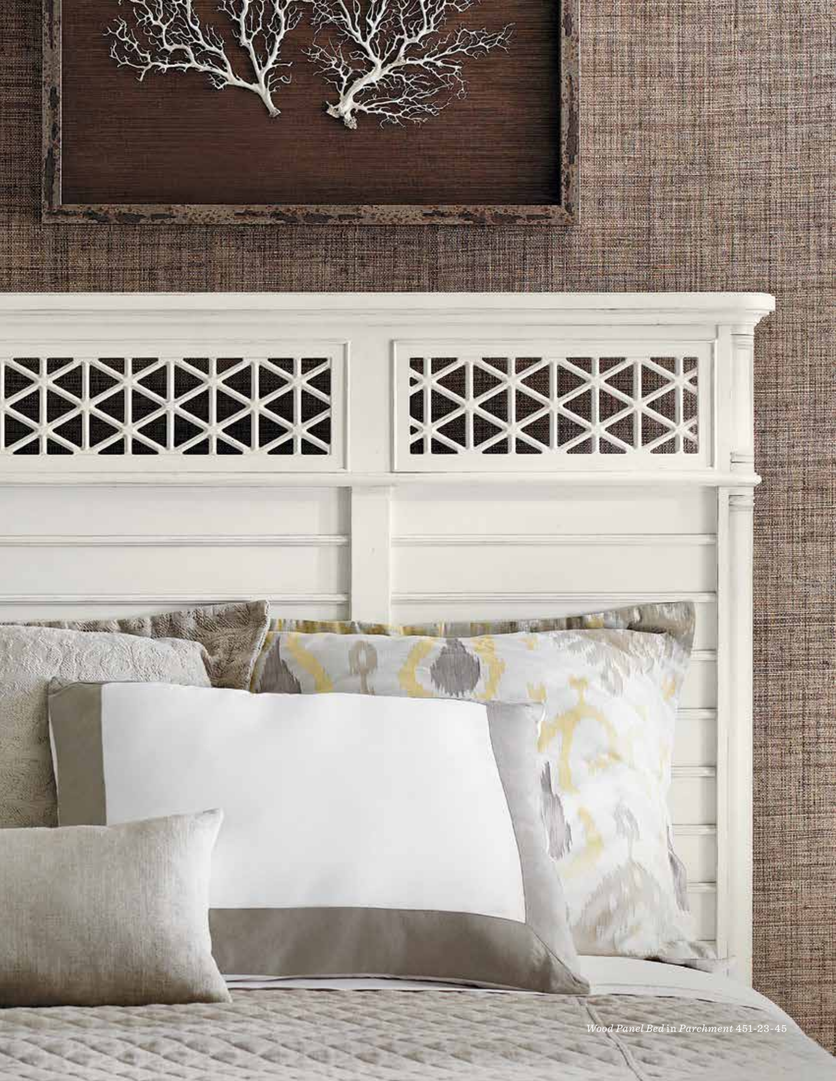
Wood Panel Bed in Parchment 451-23-45