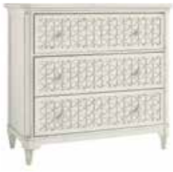
451-23-04 MEDIA CHEST PARCHMENT

Two standard drawers, one fold down media drawer