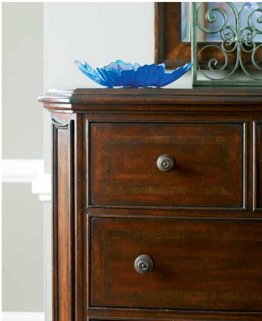
RIGHT: Cross-grain quartered walnut inlays in the drawer fronts add visual texture and dimension to the Dresser.