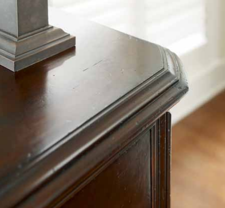
ABOVE: Canted corners and distressing details invitingly soften the bow front profile of the Triple Dresser.