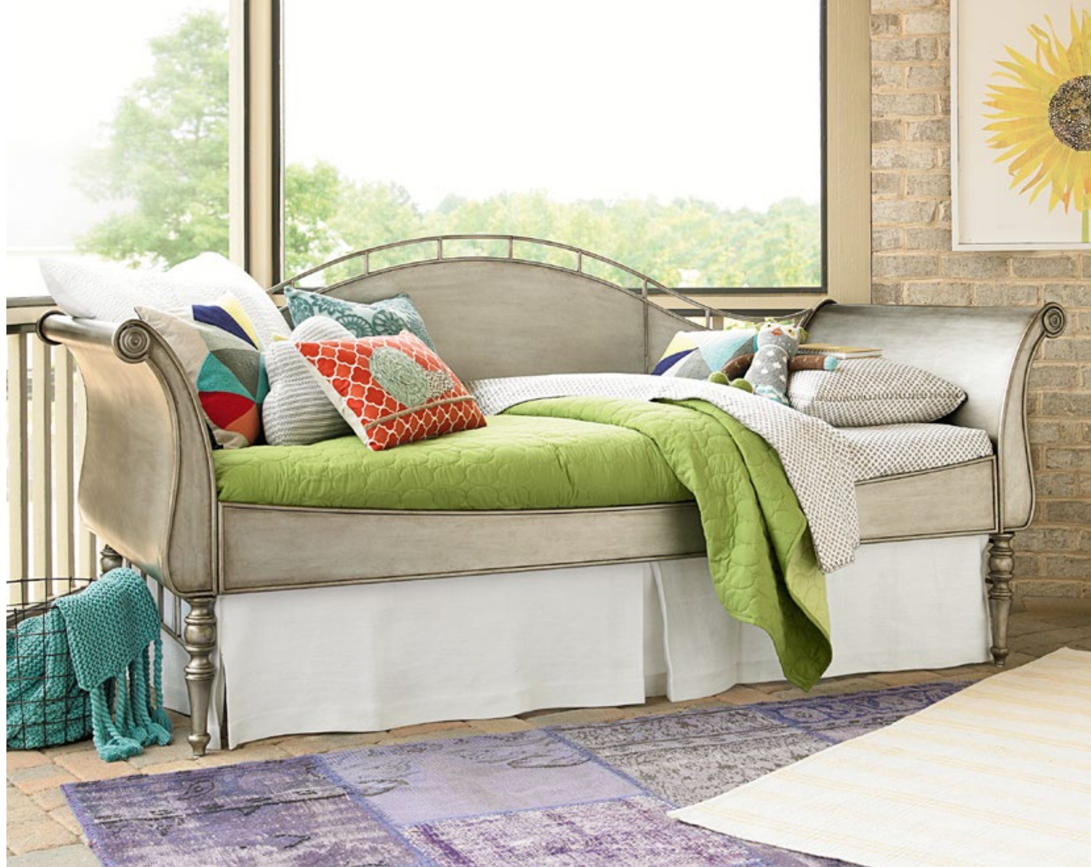
Daydreamer's Daybed 330A039 Twin 93w x 40d x 43h