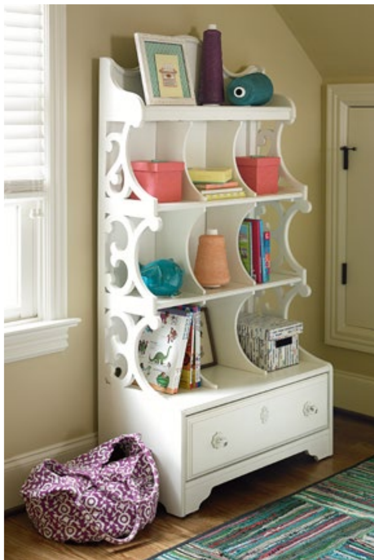
Book Nook 330A018 / 32w x 16d x 63h