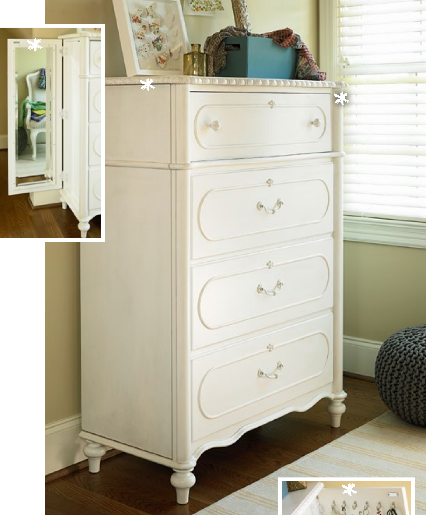
Drawer Chest 330A010 / 38w x 19d x 52h

*smart Talk about unique! The left end of this Drawer Chest opens to reveal a full-length mirror, and the right end opens and features hidden accessory hooks.