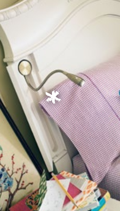
*smart Built-in lighting is strategically placed for studying.