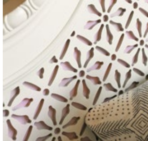
The Trellis Bed (Antique Rose insert shown) 330A040 Full 60w x 81d x 53h (footboard height is 23")