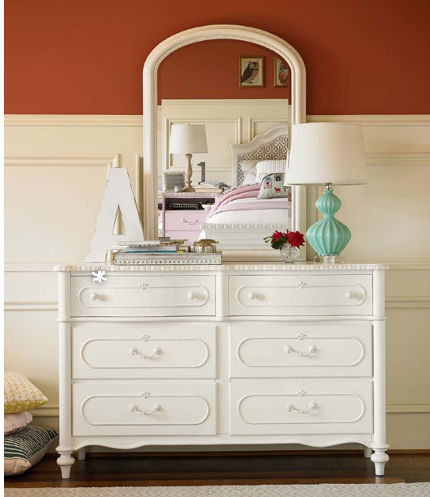
Vertical Mirror 330A031 / 29w x 2d x 43h