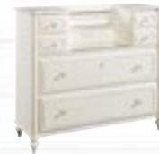
330A004 DRESSING CHEST