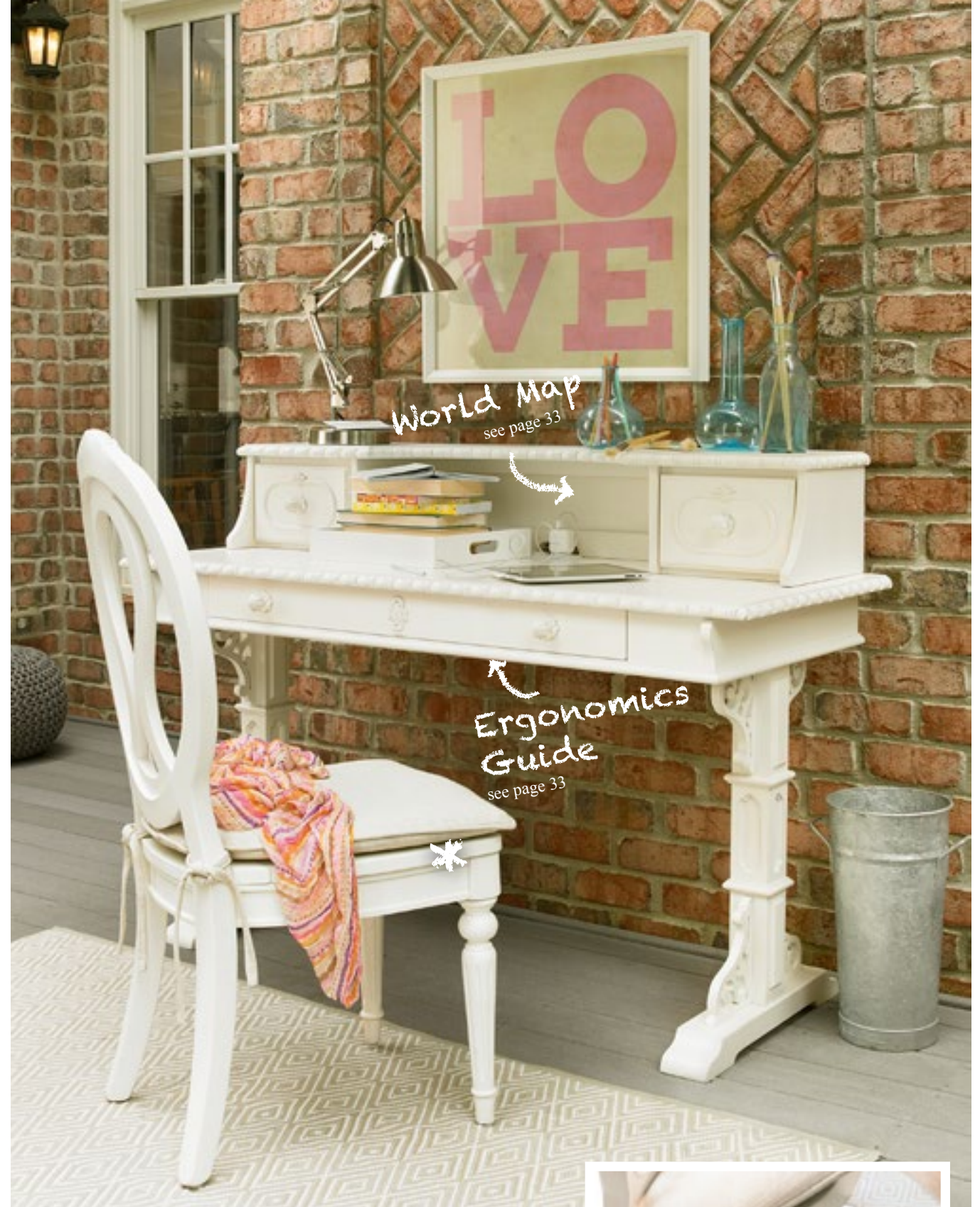
XOXO Desk 330A028 / 54w x 22d x 39h

*smart Beveled mirror front slides open to reveal accessory hooks and storage.