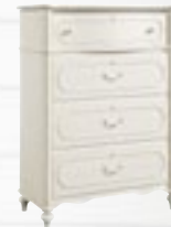
330A010 DRAWER CHEST