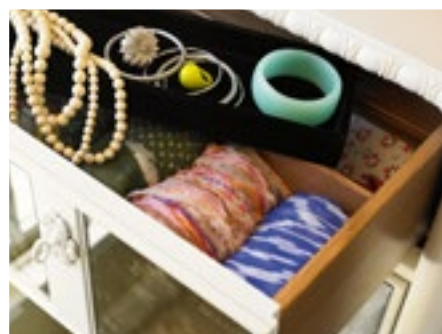
Tall Chest 330A011 / 23w x 19d x 52h