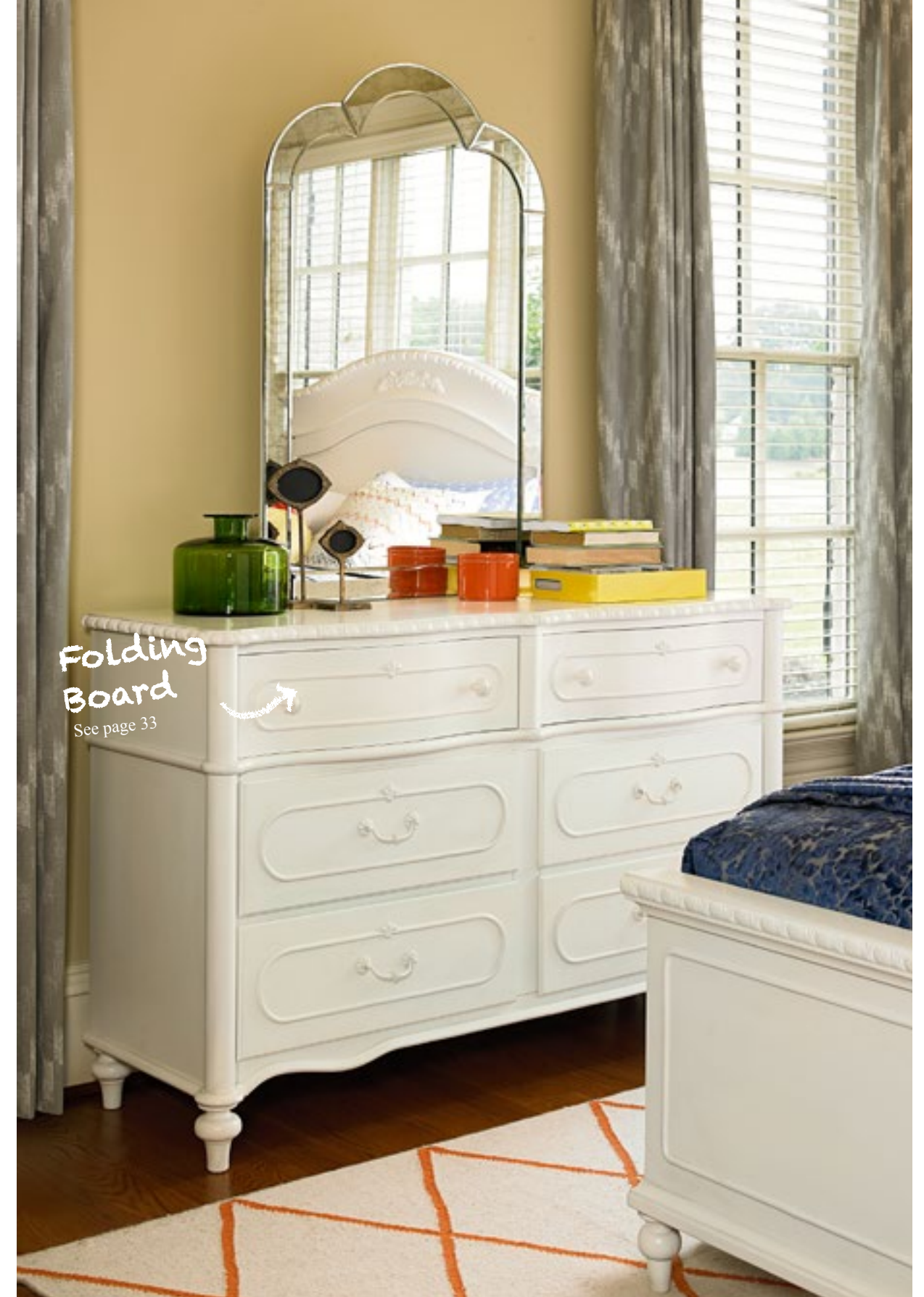
Venetian Mirror 330A030 / 29w x 2d x 43h