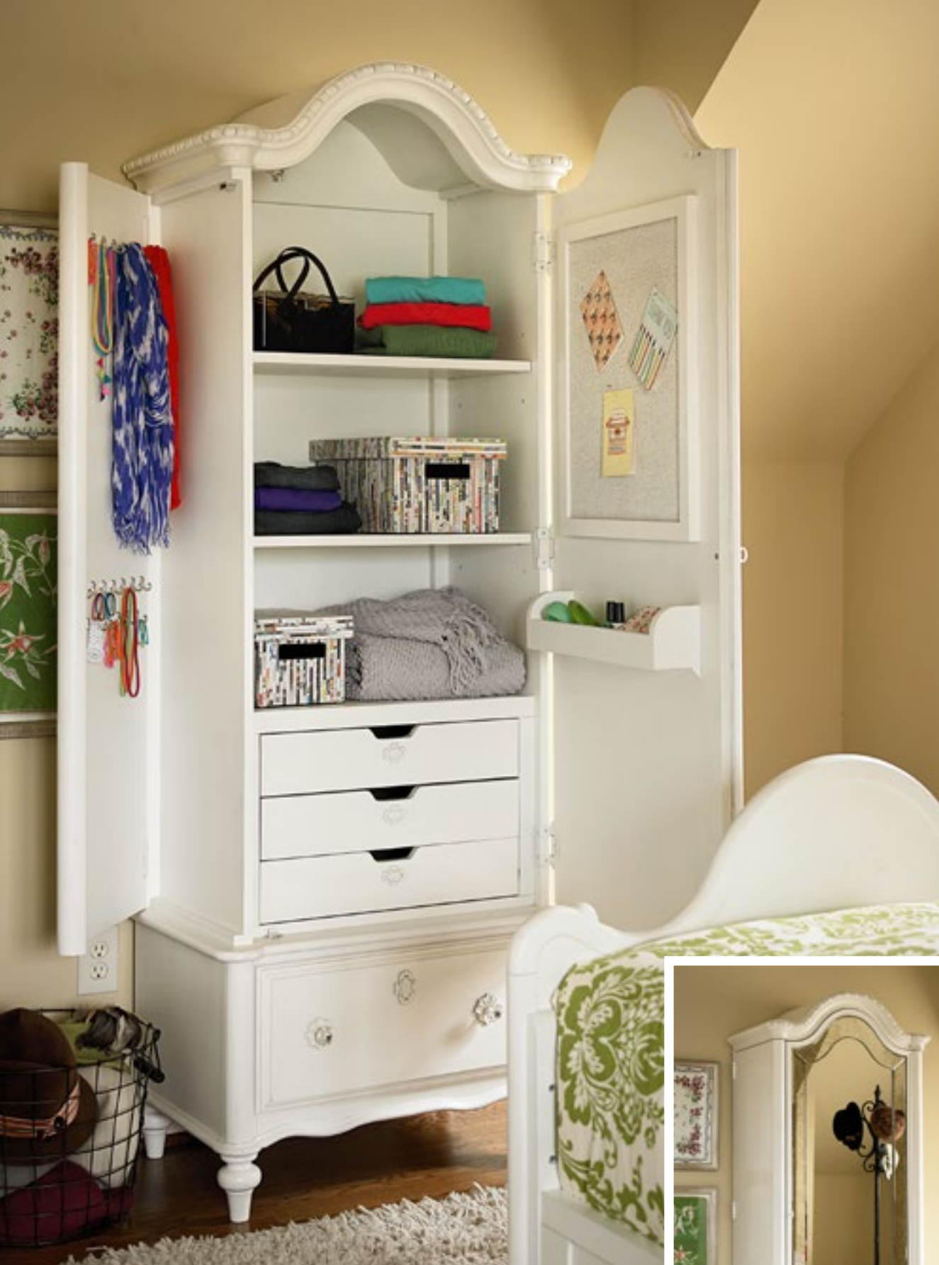
Vintage Armoire 330A014 / 29w x 19d x 80h