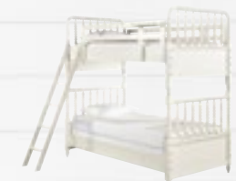
VINTAGE BUNK BED