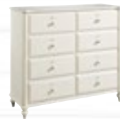
330A005 HEIRLOOM CHEST