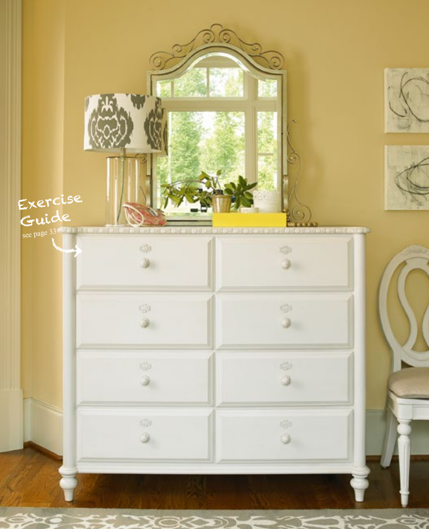
Memoir Mirror 330A033 / 36w x 2d x 37h