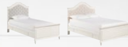
THE TRELLIS BED