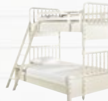
330A590 TWIN OVER FULL EXT KIT