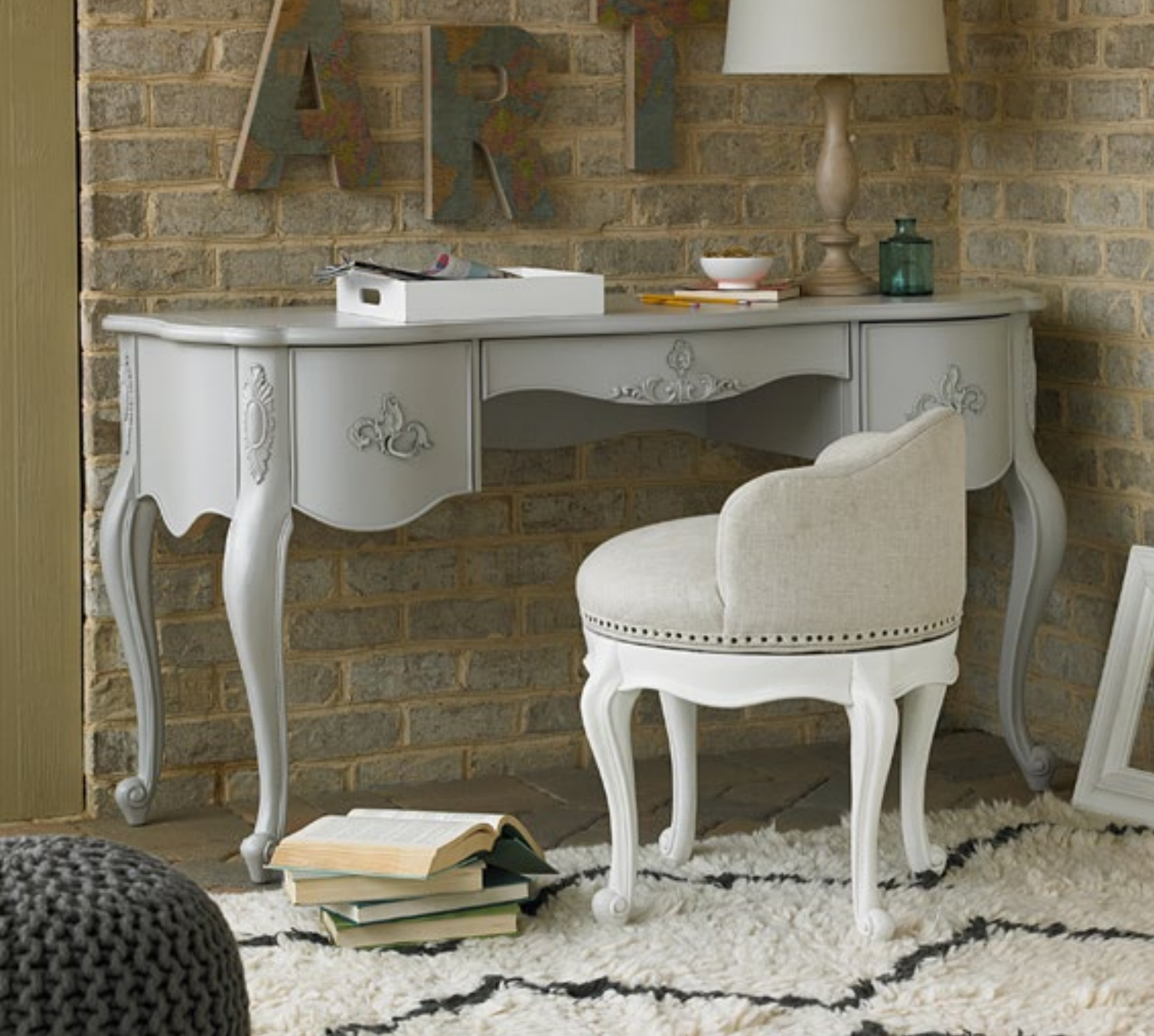
Journaling/Vanity Desk (French Grey shown) 330B027 / 56w x 22d x 30h