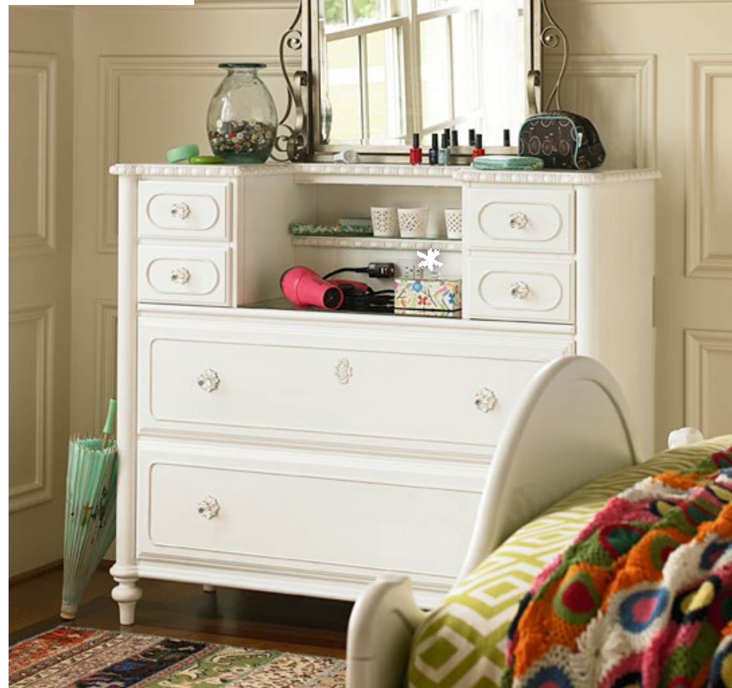
Memoir Mirror 330A033 / 36w x 2d x 37h

*smart An electrical outlet exactly where you need it. Cool, huh?