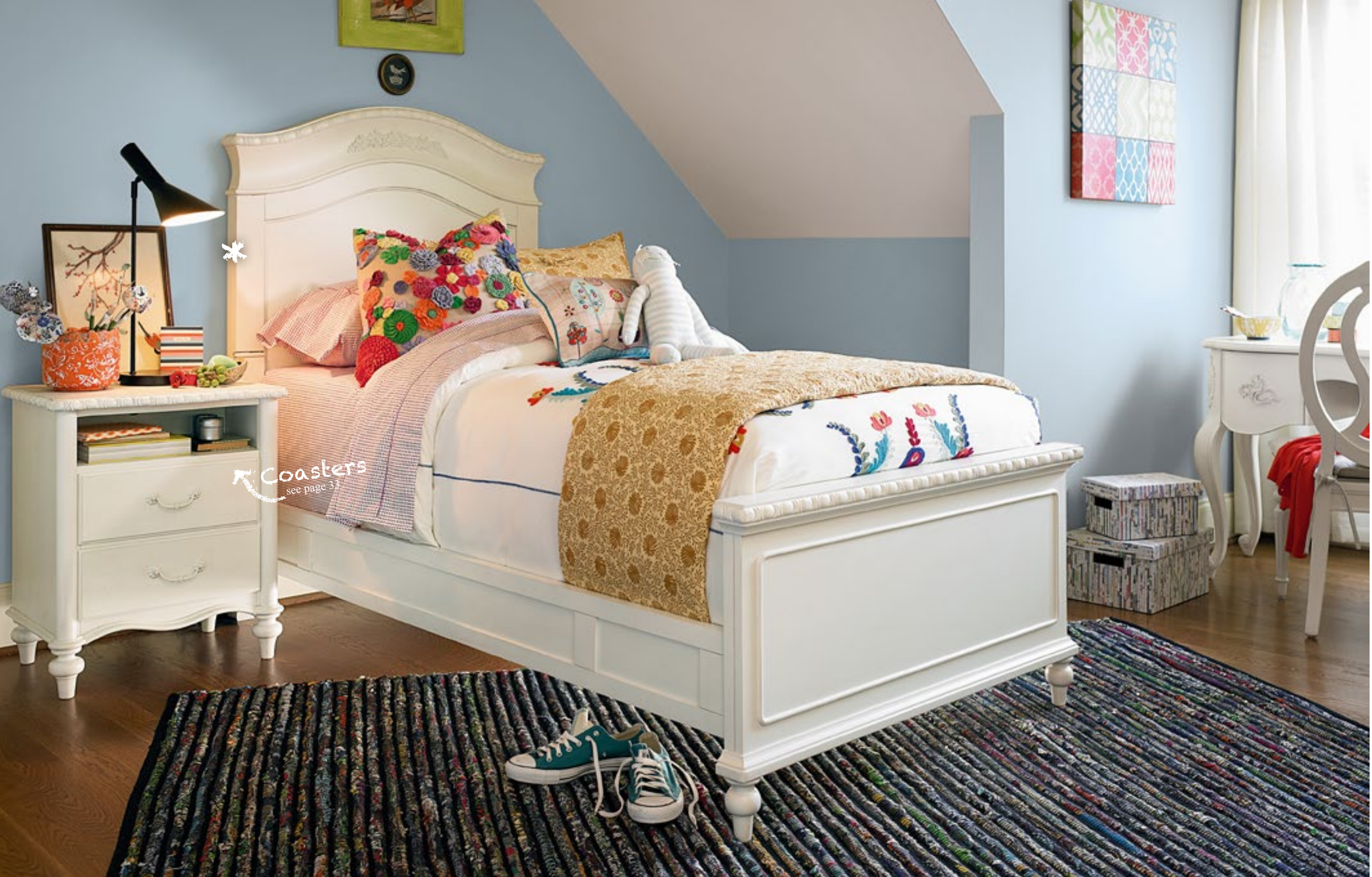
Nightstand 330A080 / 23w x 18d x 27h