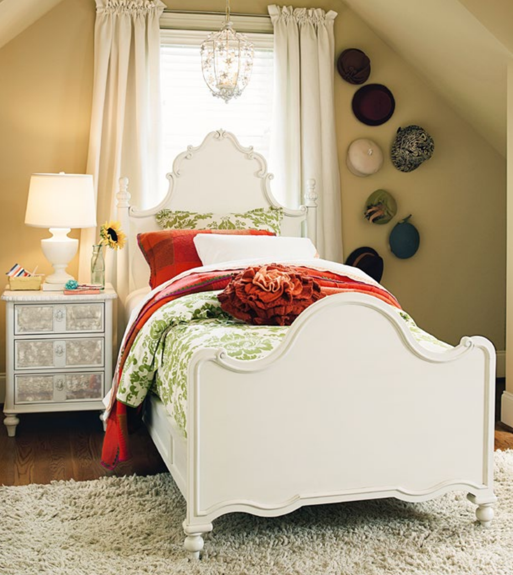
Bellamy's Bed 330A038 Twin 43w x 81d x 60h (footboard height is 35")