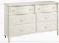
330A002 BELLAMY'S DRESSER