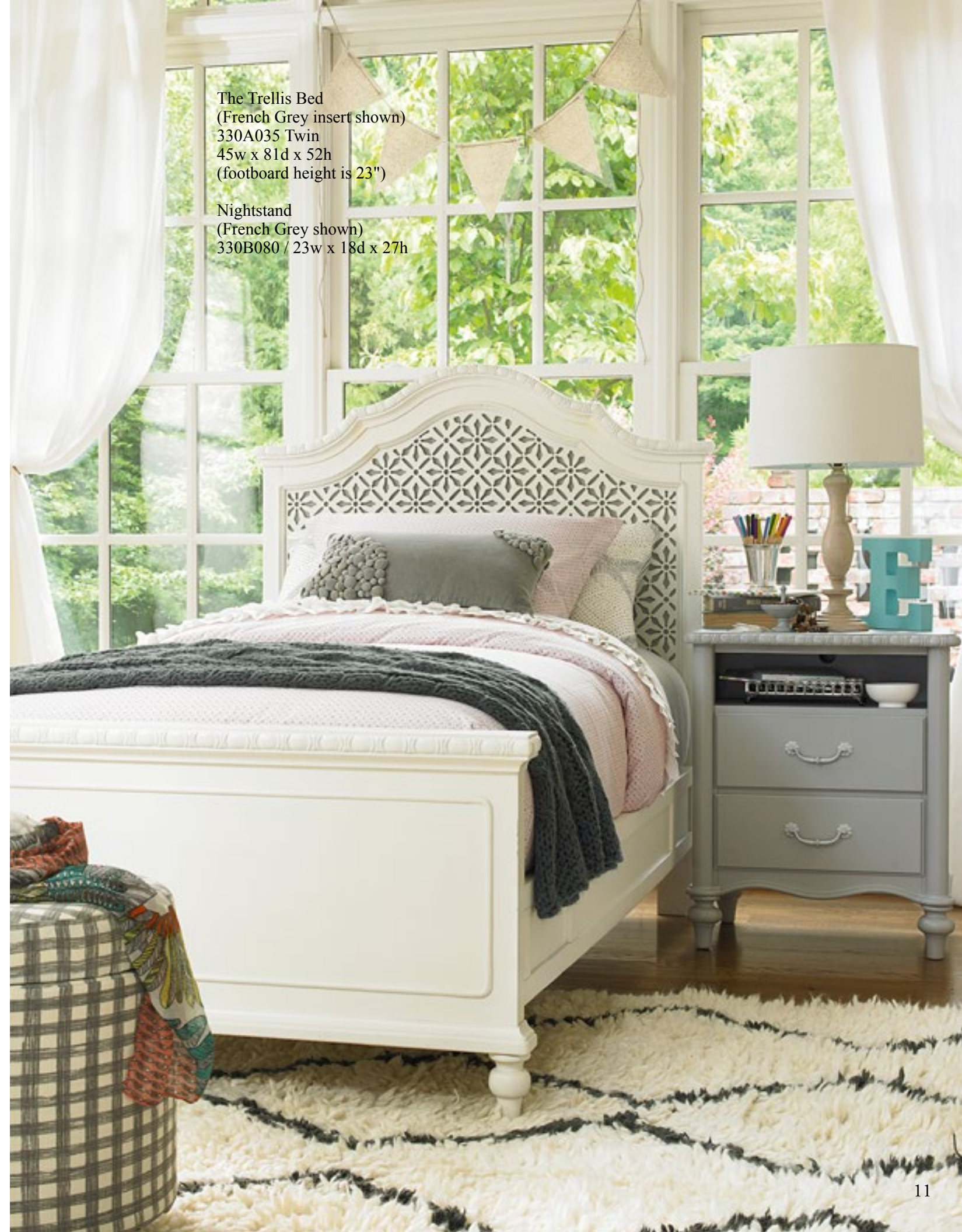
The Trellis Bed (French Grey insert shown) 330A035 Twin 45w x 81d x 52h (footboard height is 23")