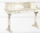
330A028 XOXO DESK