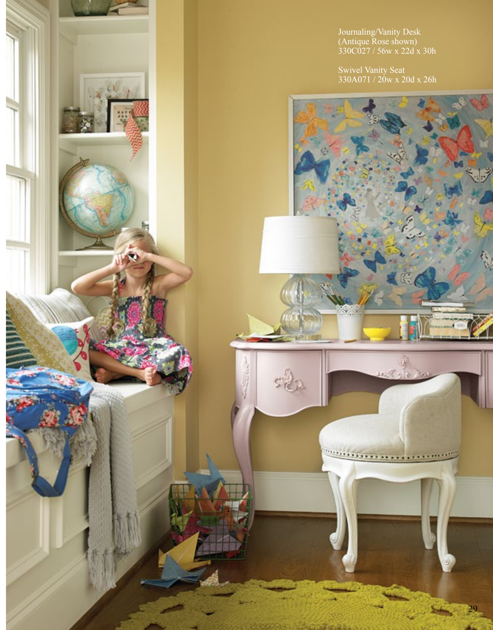
Journaling/Vanity Desk (Antique Rose shown) 330C027 / 56w x 22d x 30h