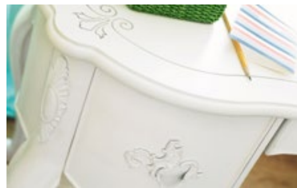
Swivel Vanity Seat 330A071 / 20w x 20d x 26h