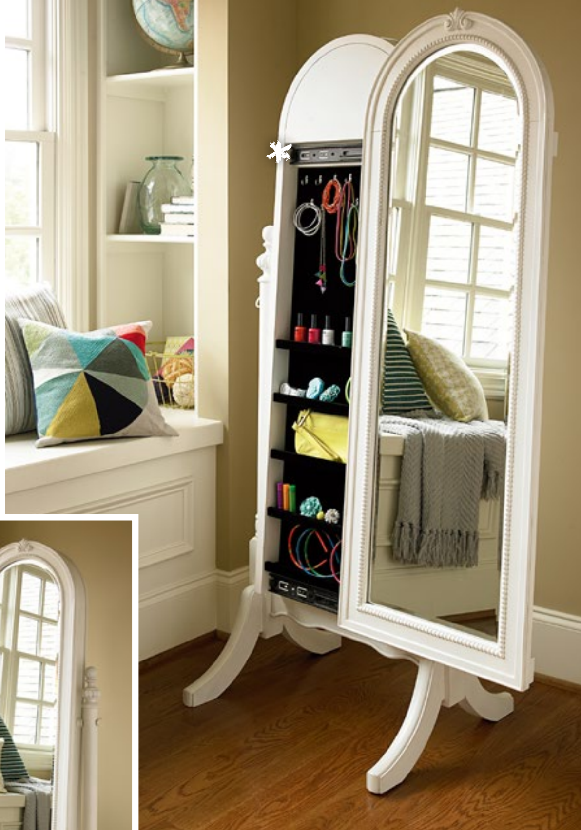
Cheval Storage Mirror 330A034 / 26w x 22d x 67h

*smart Beveled mirror front slides open to reveal accessory hooks and storage.