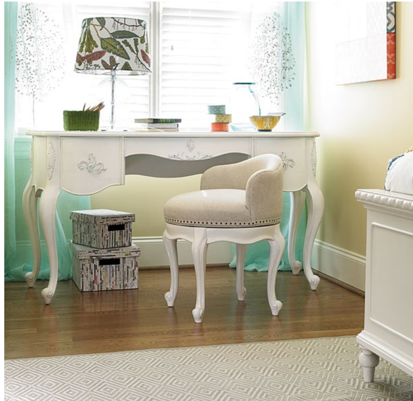
Journaling/Vanity Desk 330A027 / 56w x 22d x 30h