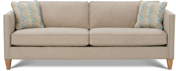
2 back over 2 seat cushion option

Shown in fabric 14999-64, toss pillow fabric 26379-34, pewter nailhead. Washed Pine wood finish.