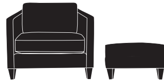
N220-006 Chair: L33 x D37 x H34 cm: L84 x D94 x H86