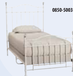
0850-5003 Twin Metal Bed 40W 80D 54H *Includes Headboard, Footboard and Rails.