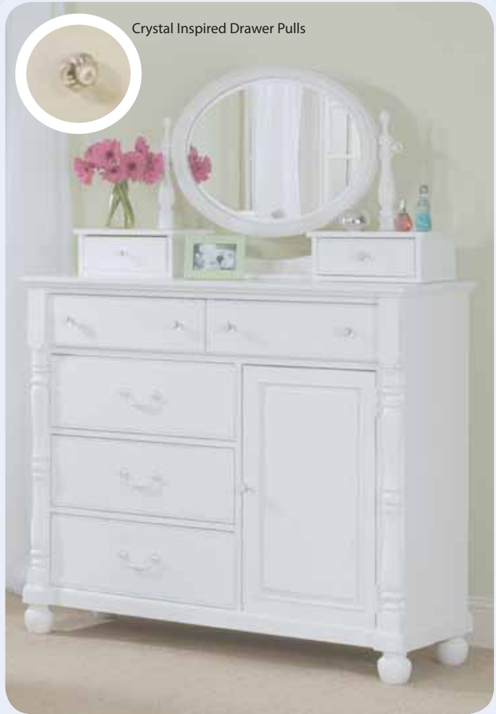
0850-1500 Bureau 0850-6201 Vanity/Bureau Mirror