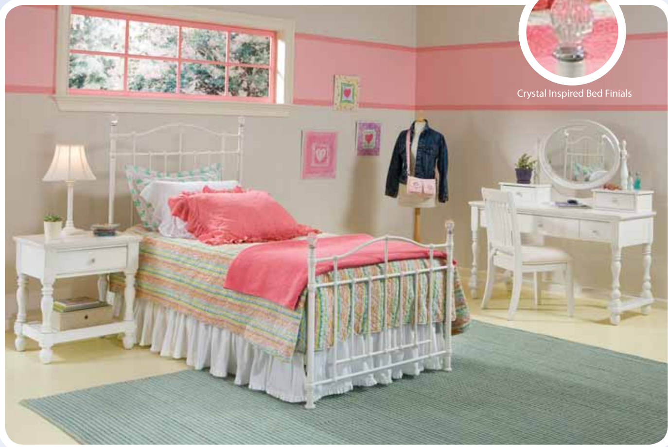
0850-3101 Open Night Stand 0850-5003 Twin Metal Bed 0850-6201 Vanity/Bureau Mirror 0850-6100 Computer Desk/Vanity 0850-640 Desk/Vanity Chair