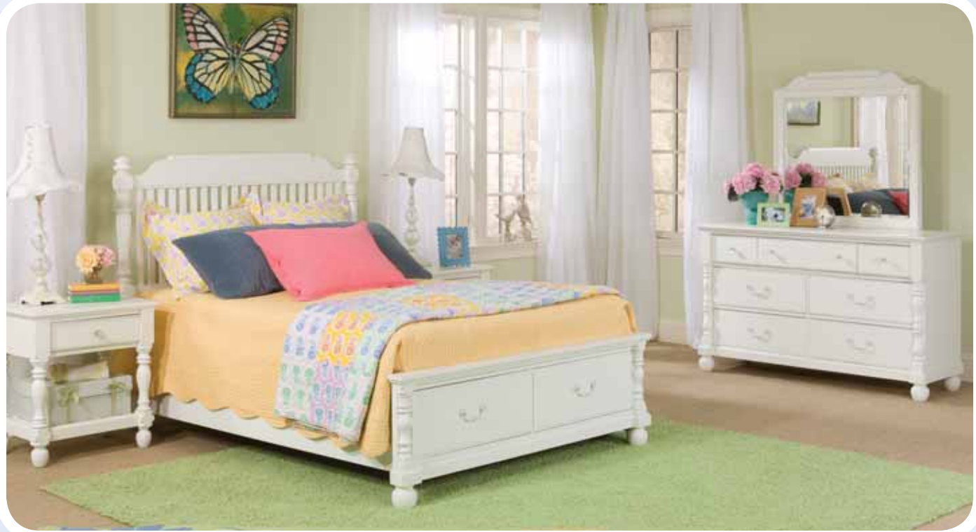
0850-3101 Open Night Stand 0850 Low Post Bed Full Size with Storage Footboard 0850-1100 Dresser 0850-0200 Scroll Top Mirror

Inspired by the inns of Martha's Vineyard Island, Olivia offers cottage style with a splash of charming Victorian detail. Girly flourishes like gingerbread carved posts, crystal inspired drawer knobs, and adjustable primping mirrors add a playful feel to this timeless look. Smart solutions like the storage footboard, storage daybed, and tall bureau offer practical style. The combination is cute, comfortable, relaxing, durable, and fun to decorate!