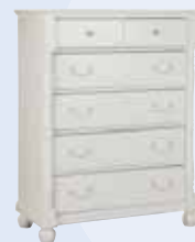
0850-2200 Drawer Chest 6 Drawers 40W 19D 52H