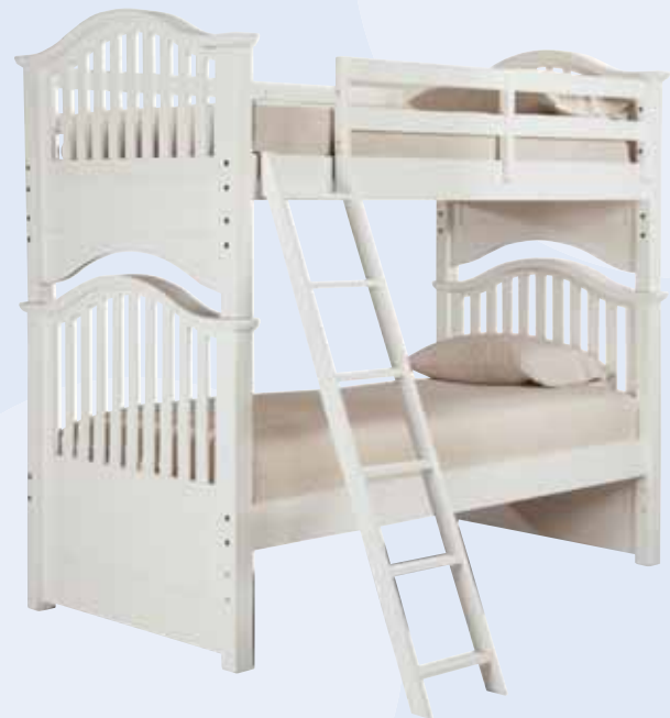
0850 Bunk Bed