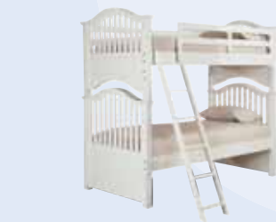
Twin over Twin Bunk 0850-8110 Bunk Bed Bolt on Rails (2 sets per carton) 0850-8120 Bunk Bed Ladder+Guard Rails 0850-8130 Bunk Bed Headboard+Footboard (2 sets per carton) 888-4923 Slat Roll Twin (2 sets required) Complete Twin over Twin Bunk 83W 69D 77H