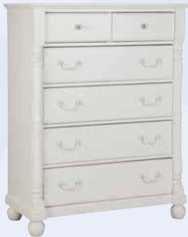
0850-2200 Drawer Chest