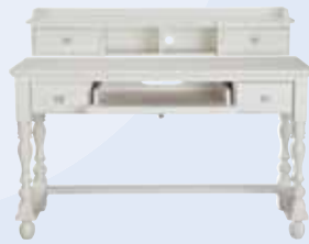
0850-6200 Low Desk Hutch/ Vanity Hutch 2 Drawers, 2 Storage Areas, Outlet 50W 12D 9H