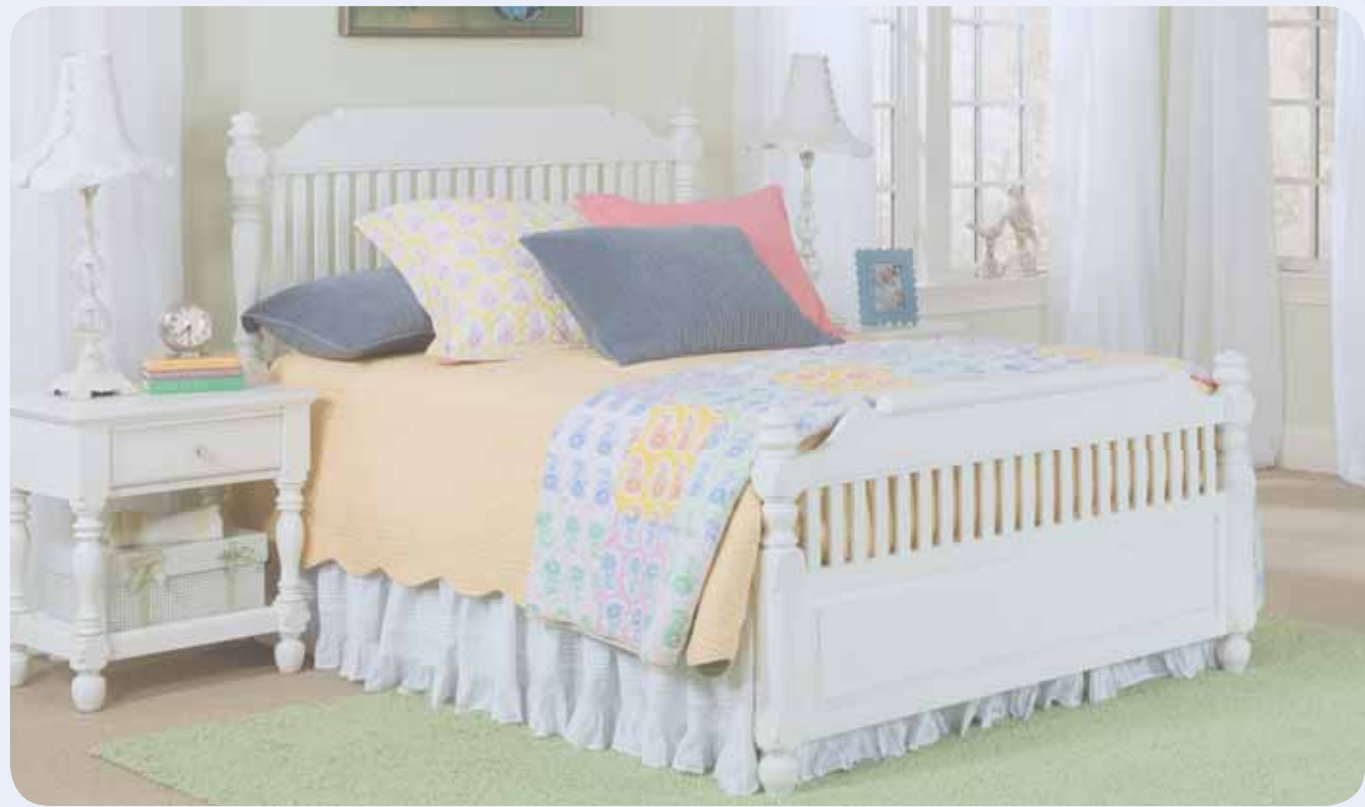
0850-3101 Open Night Stand 0850 Low Post Bed Full Size