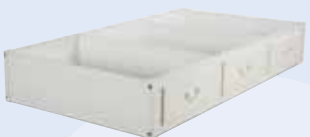
0850-9500 Trundle/Storage Drawer On casters, 2 removable dividers included 75W 41D 13H Use with the 0850 Twin and Full Low Post Bed, Day Bed, Bunk Bed or Bunk Bed with Extension. Takes a foam trundle mattress for use as an extra bed. Maximum mattress size: 73W 80 38H. Or removable dividers provide underbed storage option. Requires bed rails. A slat roll is recommended.