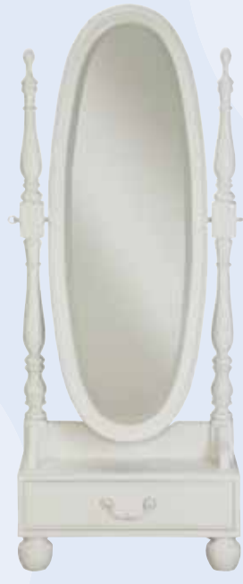
0850-0400 Cheval Floor Mirror