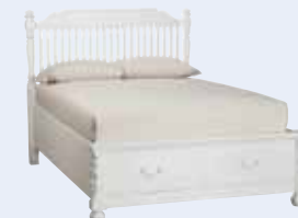
Low Post Bed with Storage Footboard Twin 0850-4203 Low Post Headboard Twin 44W 4D 52H