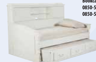
Bookcase Day Bed 0850-5601 Day Bed Sides 0850-5602 Day Bed Bookcase Back + Rails 2 reversible cork sliding doors with removable shelves, Outlet, & Removable Center Shelf Complete Bookcase Day Bed Twin 83W 52D 55H *Shown with Trundle/Storage Drawer