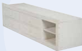
0850-9100 Underbed Storage Unit Includes 1 Panel Rail, 4 drawers, 1 adjustable shelf 76W 20D 20H Use with the 0850 Twin & Full Low Post bed, Bunk Bed, and Bunk Bed with Extension in place of bed rails. Two 9100 Underbed units can be used together for double storage. REQUIRES SLAT ROLL. REPLACES RAILS.