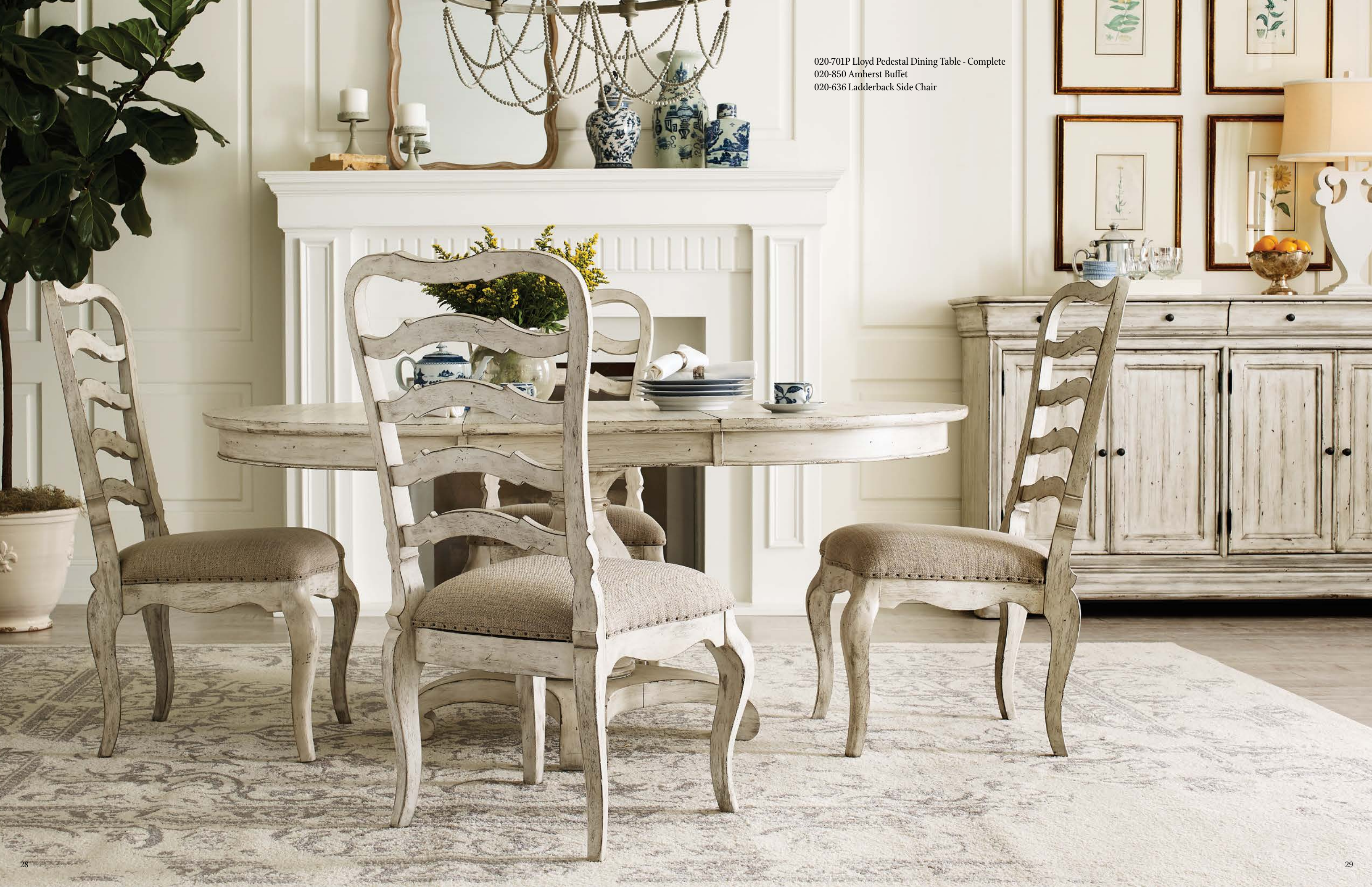
020-701P Lloyd Pedestal Dining Table - Complete 020-850 Amherst Buffet 020-636 Ladderback Side Chair