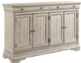
020-850 Amherst Buffet W66 D18 H42 Four doors, two drawers, two adjustable wood shelves behind each seat of doors, four wood shelves total, center foot, adjustable levelers, brown felt pad in top two drawers. Drawer size: W27-3/14 D14 H1-1/2, Shelf size behind two doors: W29-1/2 D13-1/2 Pages 17, 22/23, 24/25, 28/29