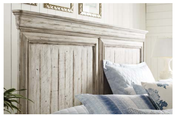
020-306P Carlisle King Panel Bed Complete (6/6) headboard detail