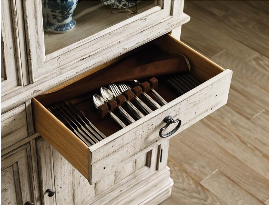
020-830P Ranier Display Cabinet - Complete silverware drawer detail