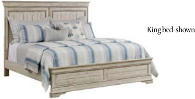
King bed shown