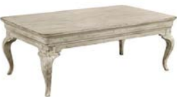
020-910 Kelsey Coffee Table W50 D28 H18 Pages 32/33