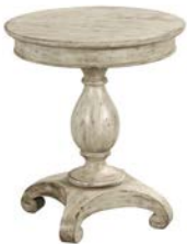
020-916 Kelsey Round End Table W22 D22 H25 Pages 31, 32/33