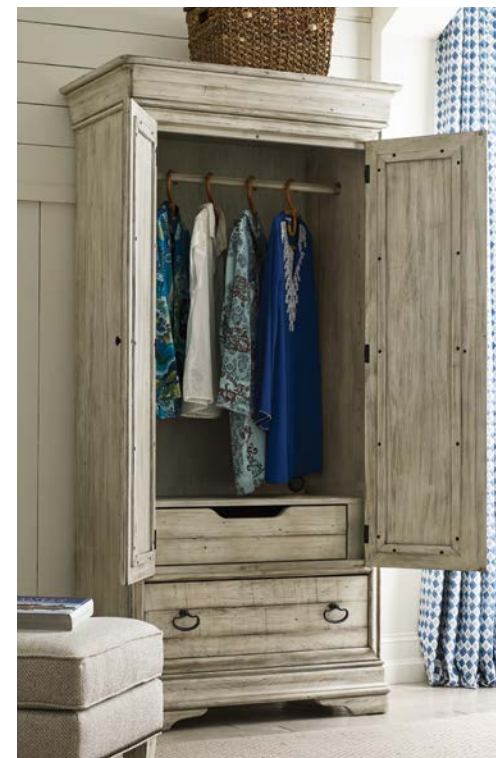
020-270 Bryant Armoire closed rod in place