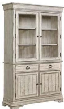
020-830P Ranier Display Cabinet - Complete W54 D18 H84 consists of: -830 Ranier Display Cabinet W51-1/2 D17-1/8 H36 Two drawers, two doors, one adjustable shelf behind each door, center foot, brown silverware tray in top right drawer, brown felt pad in top left drawer, adjustable levelers -831 Ranier Display Cabinet Deck W54 D18 H48 Two wood framed doors with seed glass, two wood framed adjustable glass shelves with plate grooves behind doors, adjustable levelers, two can lights Pages 18/19, 26/27