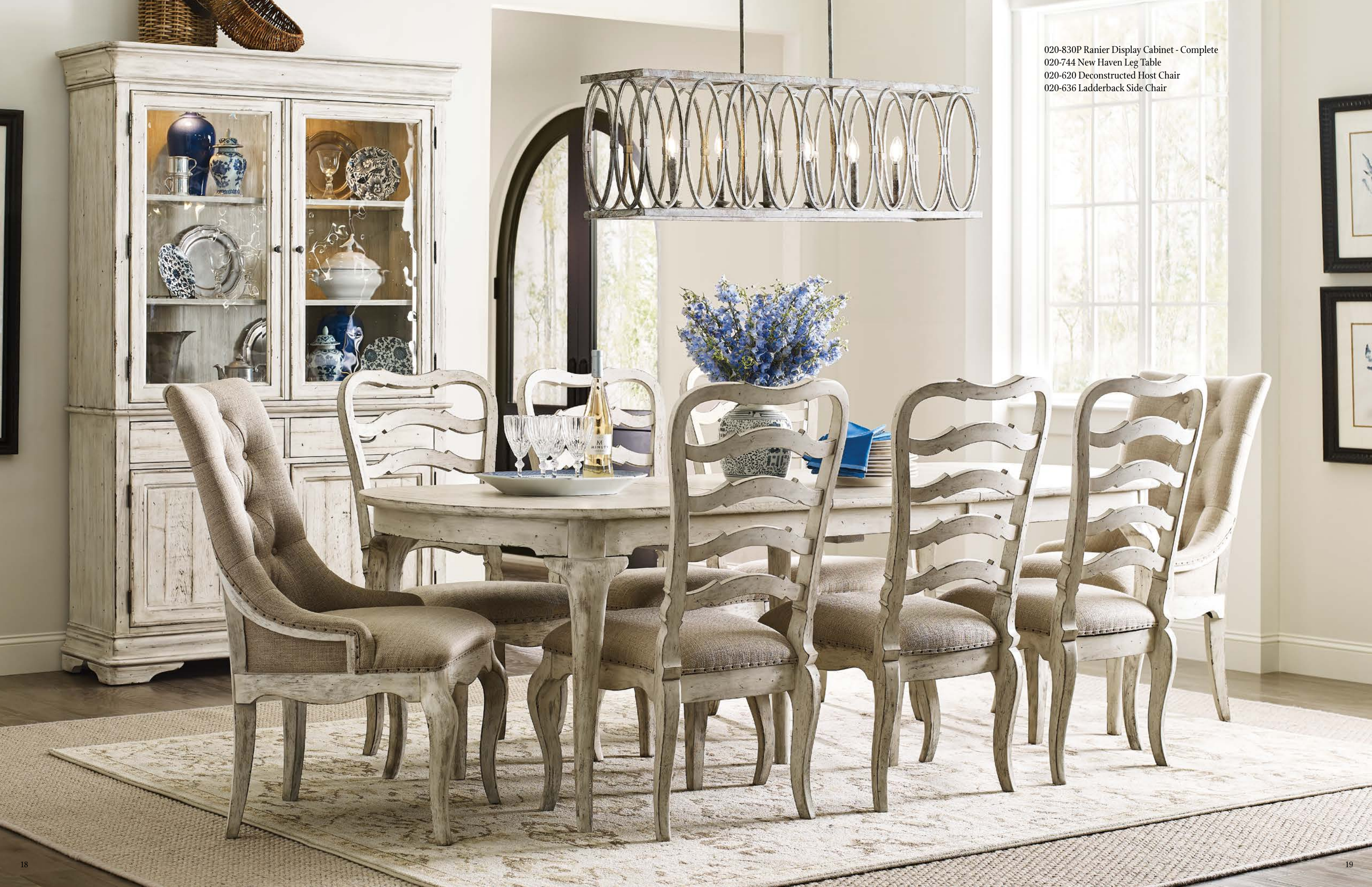
020-830P Ranier Display Cabinet - Complete 020-744 New Haven Leg Table 020-620 Deconstructed Host Chair 020-636 Ladderback Side Chair