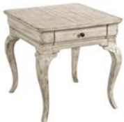
020-915 Kelsey End Table W24 D27 H24 One drawer, shelf, shelf size: W13-5/8 D16 H1-5/8 Pages 32/33, 34, 36/37