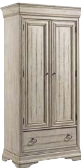
020-270 Bryant Armoire W38 D21 H78 Two drawers, one drawer is behind doors, two doors, cord exit holes, three adjustable shelves, one fixed shelf, removable closet rod, adjustable levelers Pages 4/5, 8/9