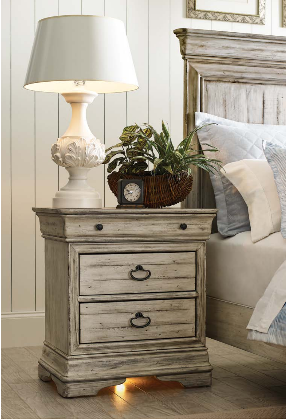
020-420 Parkland Nightstand night light on