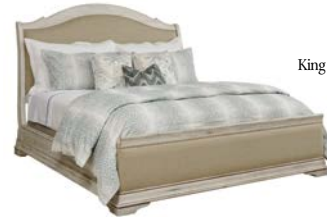
King bed shown

Three drawers, night light, electric outlet on back of case, adjustable levelers, brown felt pad in top drawer Pages 4/5, 6/7