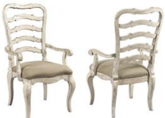
020-637 Ladderback Arm Chair W23-1/4 D24-5/16 H42 Upholstered seat, wood back Dover Brindle fabric (Live Smart) Seat height: 19 Seat depth: 18-1/2 Arm height: 25-1/4 Pages: 19, 20, 22/23