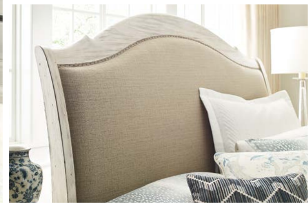
020-326P Kelly King Upholstered Sleigh Bed Complete (6/6) headboard detail

020-326P Kelly King Upholstered Sleigh Bed Complete (6/6) 020-423 Wexford Bachelor's Chest 020-130 Whiteside Dresser