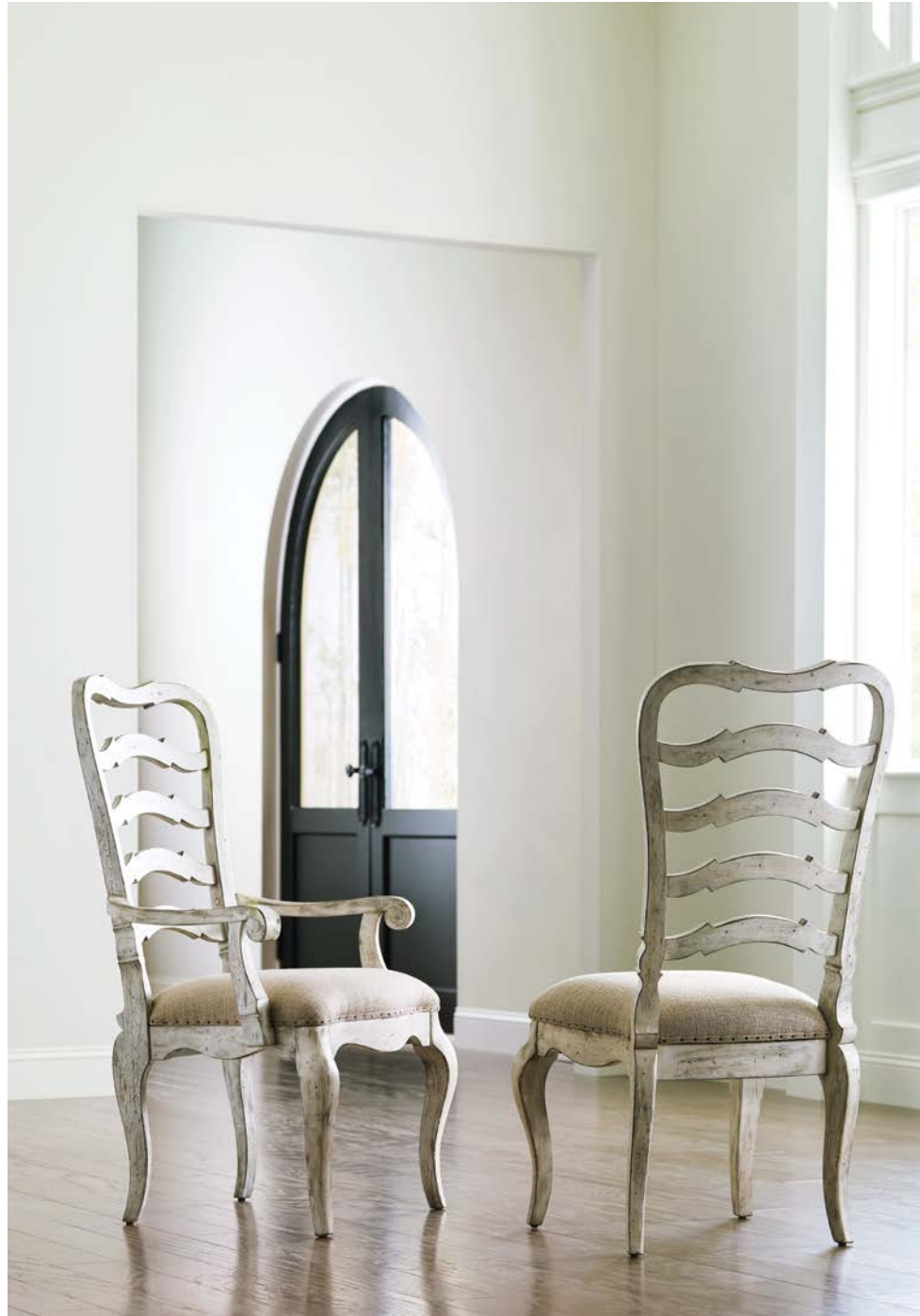
020-637 Ladderback Arm Chair, 020-636 Ladderback Side Chair

Opposite Page | 020-620 Deconstructed Host Chair