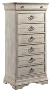
020-225 Walker Semainier W28 D18 H56 Seven drawers, second and third drawers down from the top have wood drawer dividers, brown felt pad in top drawer, adjustable levelers Pages 1