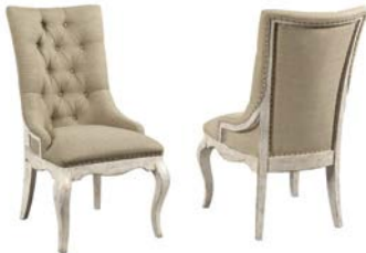
020-620 Deconstructed Host Chair W23-1/8 D26-1/2 H42 Upholstered seat and back Dover Brindle fabric (Live Smart) Seat height: 19-1/2 Seat depth: 19 Pages: 18/19, 21, 24/25