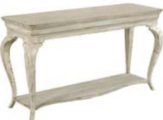
020-925 Kelsey Sofa Table W54 D18 H29 One shelf, lower shelf size: W47 D11 H20-1/2 Pages 35