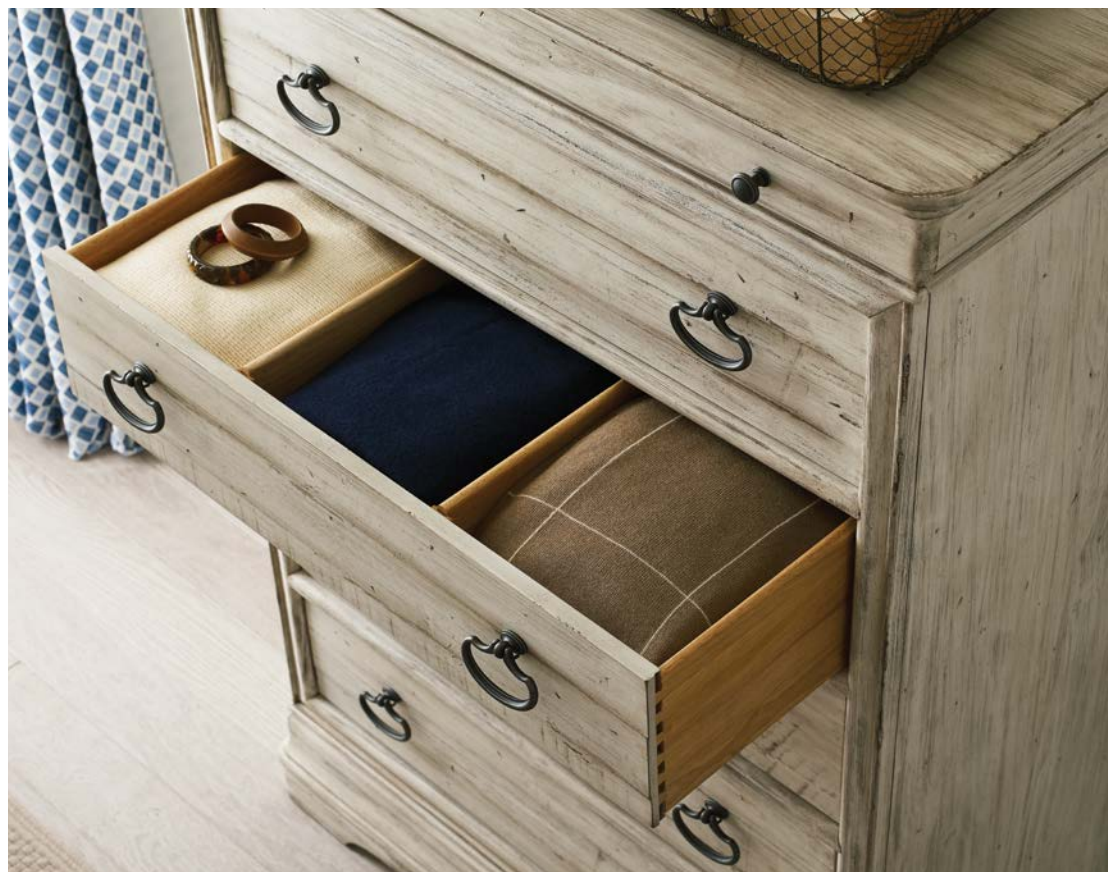
020-215 Prospect Drawer Chest jewelry tray detail

Opposite Page | 020-215 Prospect Drawer Chest