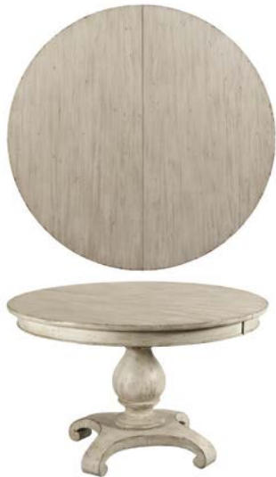
020-701P Lloyd Pedestal Dining Table - Complete Dia 48 H30 consists of: -701 Lloyd Pedestal Dining Table Top Dia 48 H3-3/4 -B01 Lloyd Pedestal Dining Table Base W32 H32 H26-1/4 Adjustable levelers, One 18" leaf