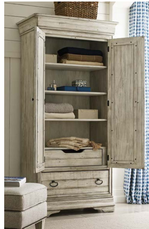
020-270 Bryant Armoire shelf details