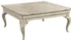
020-912 Kelsey Square Coffee Table W42 D42 H18 Pages 36/37