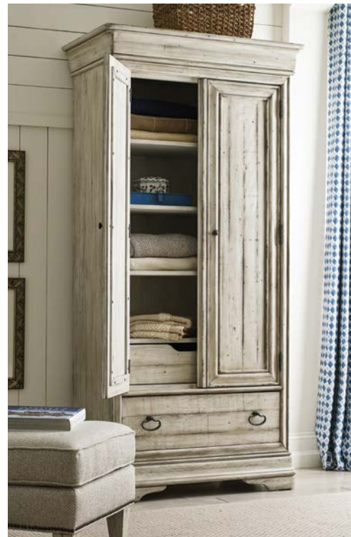
020-270 Bryant Armoire