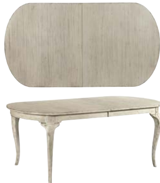
020-744 New Haven Leg Table W74 D40 H30 Adjustable levelers, two 20 inch leaves