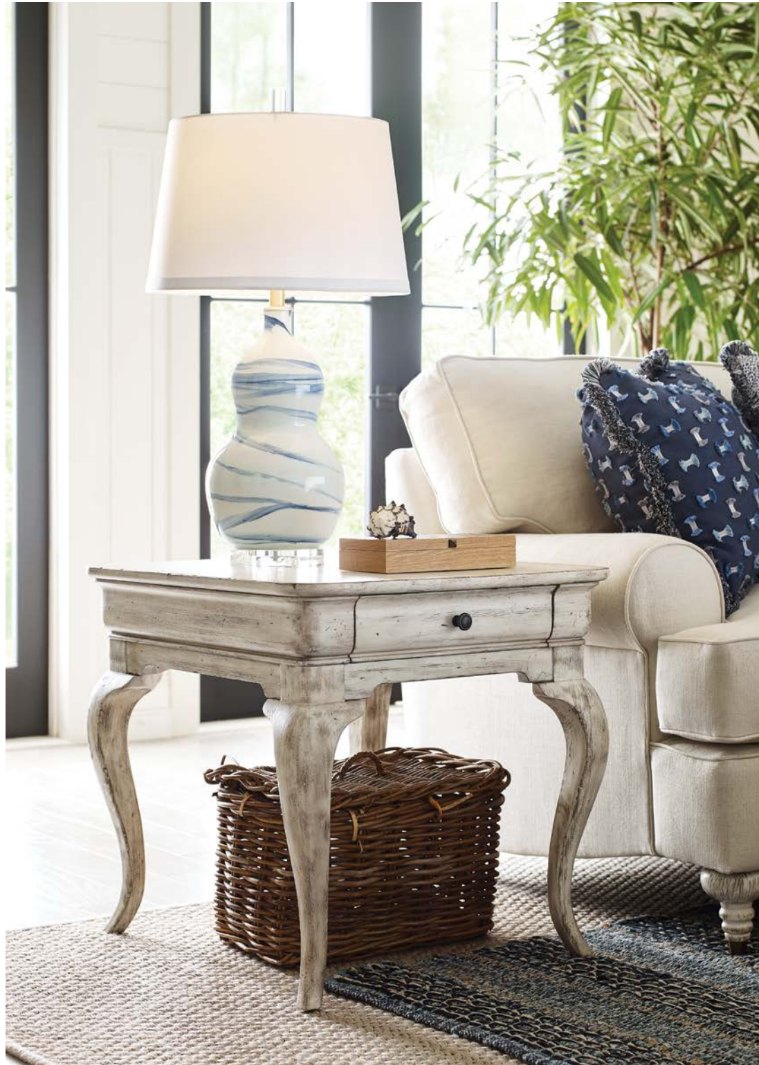
020-915 Kelsey End Table

Opposite Page | 020-925 Kelsey Sofa Table