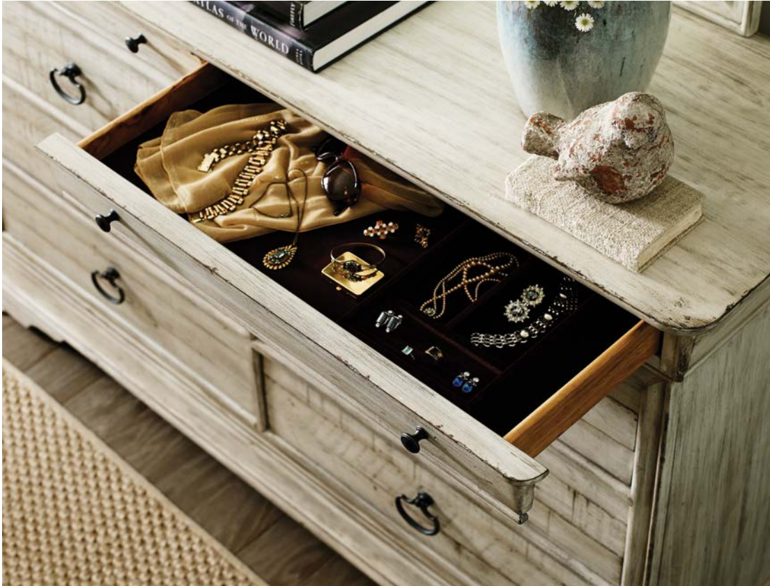
020-130 Whiteside Dresser jewelry tray detail