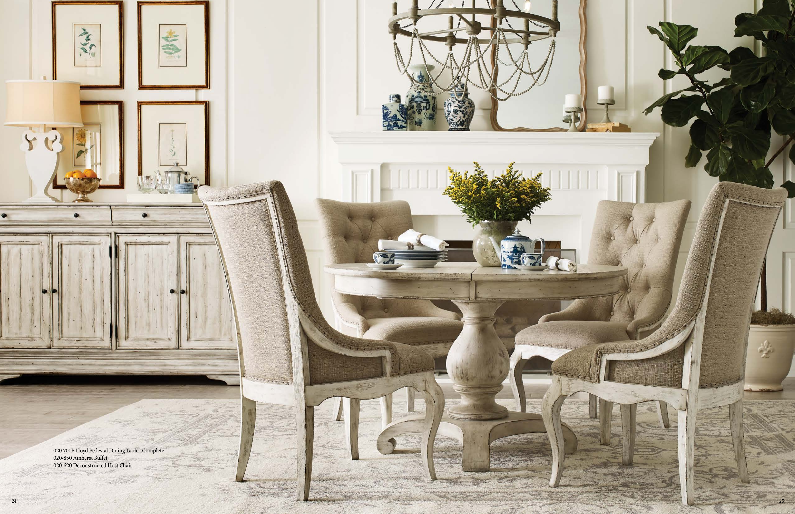
020-701P Lloyd Pedestal Dining Table - Complete 020-850 Amherst Buffet 020-620 Deconstructed Host Chair