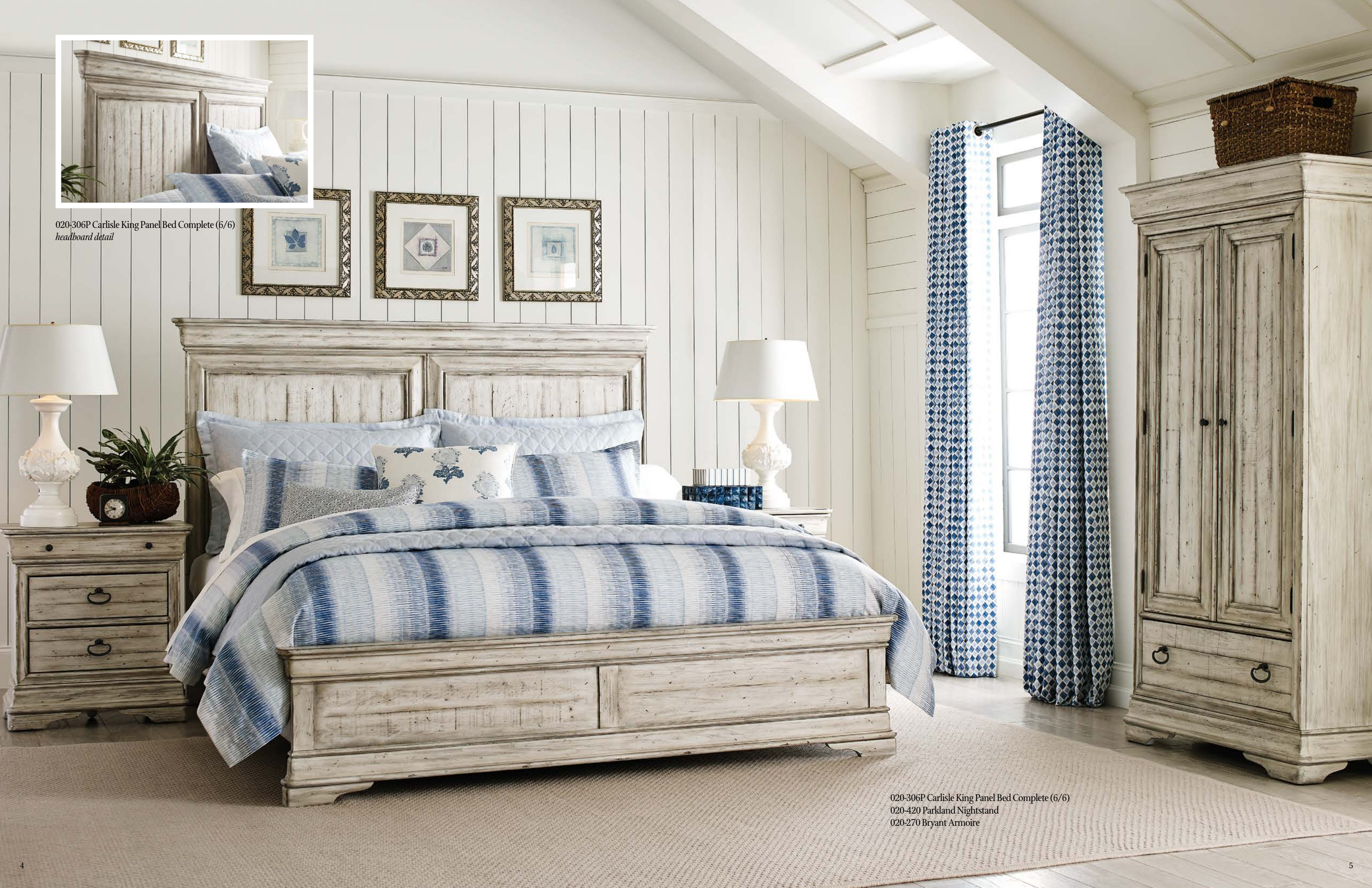
020-306P Carlisle King Panel Bed Complete (6/6) 020-420 Parkland Nightstand 020-270 Bryant Armoire