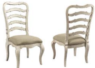
020-636 Ladderback Side Chair W21-1/2 D24-7/16 H42 Upholstered seat, wood back Dover Brindle fabric (Live Smart) Seat height: 19 Seat depth: 18-1/2 Pages: 18/19, 20, 22/23, 28/29