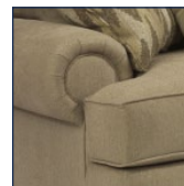
6 Roll Panel

Step 2 Select your arm style from options 6-9 6 – Roll Panel 7 – Roll Sock 8 – English 9 – Track 0 – For an armless piece ( Ottoman or Armless Love Seat )