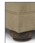
CB Carved Bun Foot