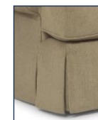
WP Waterfall Pleat Skirt