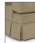
KP Kick Pleat Skirt