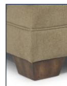
BL Block Leg

Step 7 Select your leg or skirt option BL – Block Leg BN – Bun Foot CB – Carved Bun Foot KP – Kick Pleat Skirt WP – Waterfall Pleat Skirt