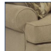
7 Roll Sock