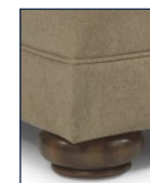
BN Bun Foot