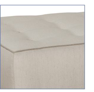
OTT-05 MODERN BUTTON