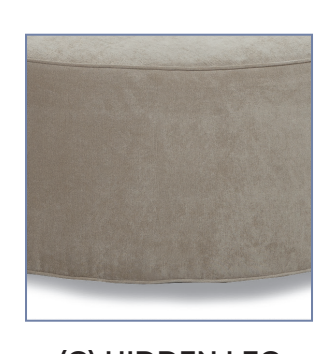
(G) HIDDEN LEG