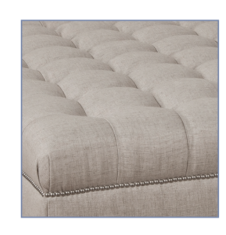
OTT-01 TUFTED Accent Nails NOT Standard