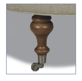
(H) TURNED LEG WITH CASTER Standard caster finish: Brass Nickel finish available.

Storage is available with A, C, G and K bases only.