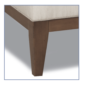
(J) TAPERED LEG WITH WOOD BASE