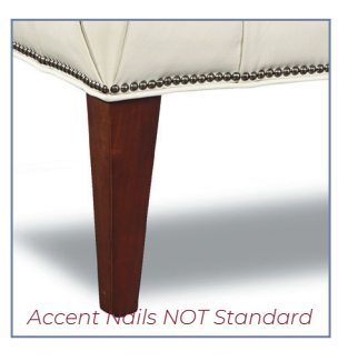
(M) TALL TAPERED LEG