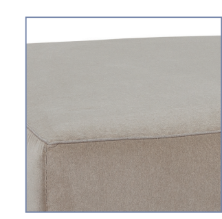
OTT-06 TIGHT BOX BORDER