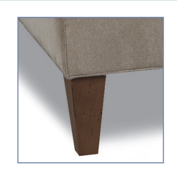
(E) TAPERED LEG