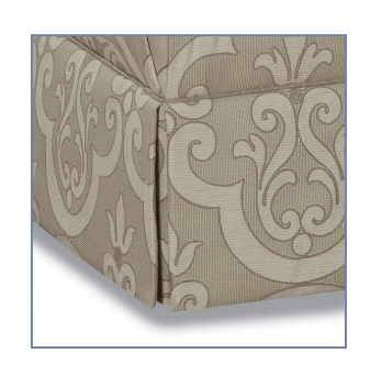
(A) KICK PLEAT SKIRT