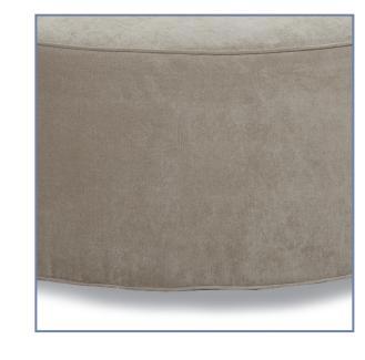
(K) HIDDEN CASTERS