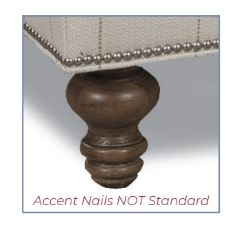
(F) TURNED LEG