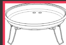
Air Fry Pan