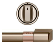
CXFCHHKPMBZ Brushed Bronze 2 handles 6 knobs (standard on Matte White)