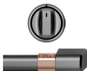
CXFCHHKPMBT Brushed Black 2 handles 6 knobs