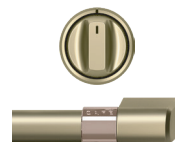
CXFCHHKPMCG Brushed Brass 2 handles 6 knobs