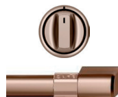
CXFCHHKPMCU Brushed Copper 2 handles 6 knobs