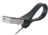
JXPROBE1 Probe Accessory