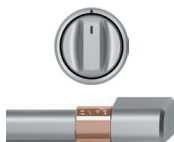
CXFCHHKPMSS Brushed Stainless 2 handles 6 knobs (standard on Matte Black)