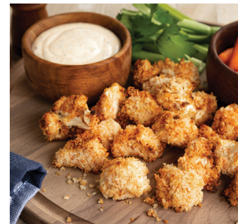
Air Fry mode makes food moist on the inside and crispy golden-brown on the outside

SHARP ELECTRONICS CORPORATION 100 Paragon Drive, Montvale NJ, 07645 1.800.237.4277 • shop.sharppusa.com