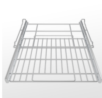
Premium Glide-Rack allows for removing even the heaviest cookware