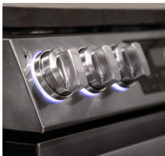
5 durable, die-cast knobs with illuminated rings make it easy to see when a burner is turned on.