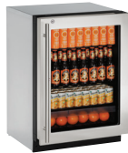
STAINLESS FRAME (LOCK)