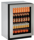
INTEGRATED FRAME (STAINLESS HANDLELESS PANEL)*