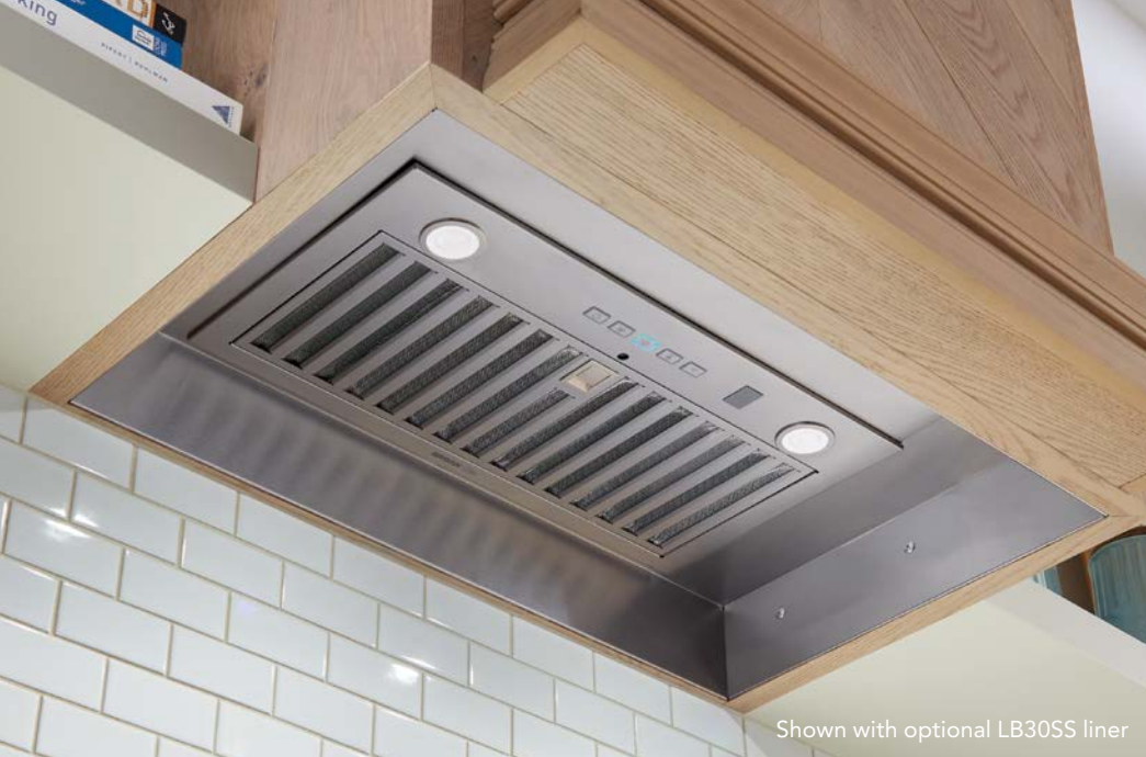
Shown with optional LB30SS liner