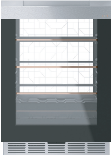
CCR06BM2PS5 Platinum Glass finish