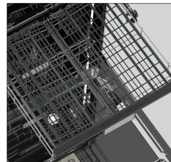
The adjustable third rack is ideal for flatware and serving instruments such as spatulas and other baking utensils.

SHARP ELECTRONICS CORPORATION 100 Paragon Drive, Montvale NJ, 07645 1.800.237.4277 • shop.sharppusa.com