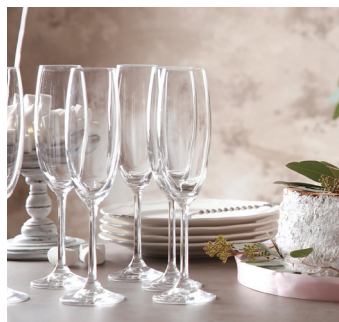
Manually raise or lower the upper rack for large casserole dishes or tall stemware.