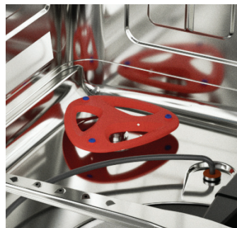
Place your most soiled pots and pans near the third sprayer for extra scrubbing power with Power Wash.