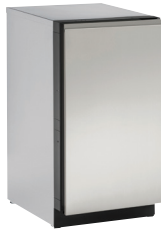
INTEGRATED SOLID (STAINLESS HANDLELESS PANEL)*