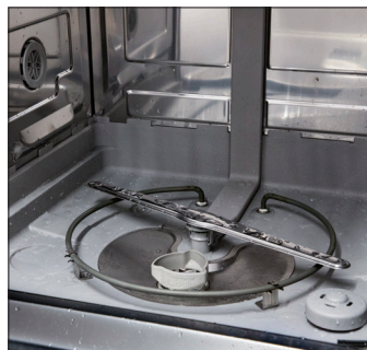
The Advanced Hybrid Tub Consists of Stainless Steel Interior with Heavy Duty Plastic Floor.