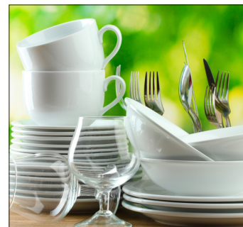
Heated Dry Option with a Dedicated Heating Element is Effective on Plastics and Minimizes the Need for Hand-Drying.

SHARP ELECTRONICS CORPORATION 100 Paragon Drive, Montvale NJ, 07645 1.800.237.4277 • www.sharppusa.com