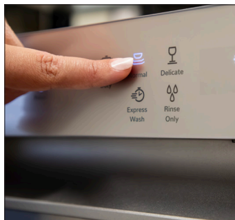
Conveniently Located in Front and Back-lit When in Use.

Classic and elegant, the SDW6504MS offers thoughtful touches inside and out. The adjustable upper rack holds larger dishes and taller glasses. The fold-down tines in the lower rack make it easier to load extra large or hard-to-fit items such as serving bowls and roasters. The SDW6504MS Stainless Steel Hybrid Dishwasher from Sharp is Simply Better Living!