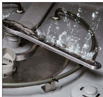
Durability Where it Matters Most. The Stainless Steel Spray Arm is Sturdy and Dependable.