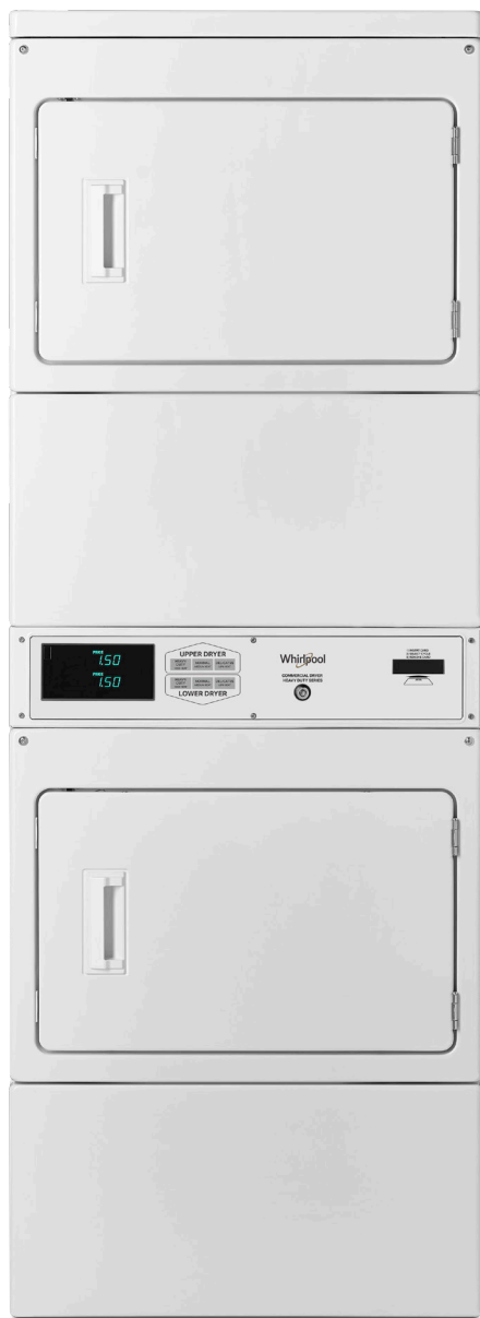
CGSP2978JQ / CESP2978JQ

Why Buy: Get the capacity of two dryers in the space of only one.