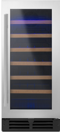
Stainless Steel WUW35X15DS