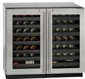
STAINLESS FRAME (LOCK)