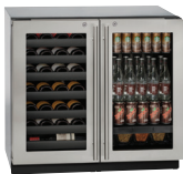
STAINLESS FRAME (LOCK)