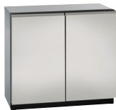
INTEGRATED SOLID (STAINLESS HANDLELESS PANEL)*