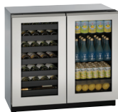
INTEGRATED FRAME (STAINLESS HANDLELESS PANEL)*