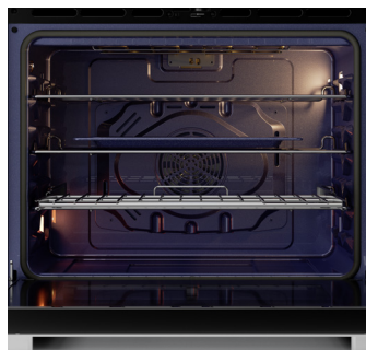
The hidden bake element and sculpted floor of the modern, cobalt blue porcelain interior makes cleanup a breeze.