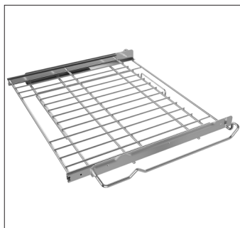
The included glide-rack allows for removing even the heaviest dishes