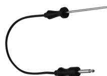
Meat Temperature Probe