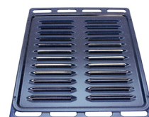
Broiler Pan / Grid

Product specifications and design are subject to change without notice.