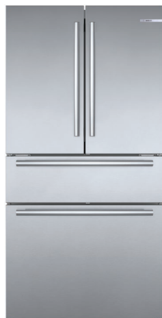
B36CL80SNS Stainless Steel

Innovative VitaFreshPro® technology helps keep food fresh up to 3x longer.* Enjoy less food waste, new innovative features and more thoughtful design.